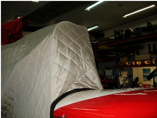
Alouette III Insulated Engine/Transmission Cover