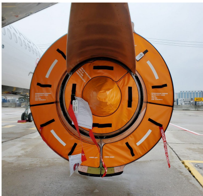
Airbus A320 Exhaust & Bypass Vent Plugs

The Engine Inlet Plugs are custom fit for your Airbus A320 intakes, made with heavy-duty vinyl material, and stuffed with a single block of sculpted urethane foam. Each plug has a zipper that allows the foam to be removed and dried if necessary. Engine plugs have 'remove before flight' streamers sewn onto the face of the plugs. Most plugs are imprinted with the aircraft registration number in black for an extra charge. Storage bag NOT included. Engine plugs may be inserted after flight when the engine is still warm. Engine Inlet Plugs are commonly referred to as Cowl Plugs, Intake Plugs, Cowl Blocks, Engine Blocks, and Engine Bungs.