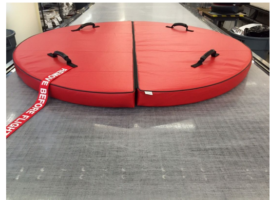
Boeing 737 Max Intake Plug, folding type