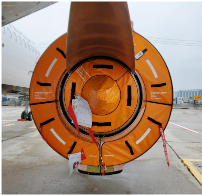
Airbus A320 Exhaust & Bypass Vent Plugs

The Engine Exhaust Plugs are custom fit for your Airbus A330, A350 exhaust openings, made with heavy-duty vinyl material, and stuffed with a single block of sculpted urethane foam. Each plug has a zipper that allows the foam to be removed and dried if necessary. Exhaust plugs have 'remove before flight' streamers sewn onto the face of the plugs. Most plugs are imprinted with the aircraft registration number in black for an extra charge. Exhaust plugs may be inserted soon after flight when the engine is still warm. Engine Inlet Plugs are commonly referred to as Cowl Plugs, Intake Plugs, Cowl Blocks, Engine Blocks, and Engine Bungs.