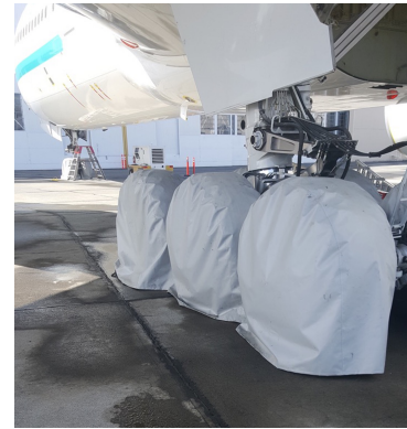
Boeing 777 Main & Nose Gear Tire Covers