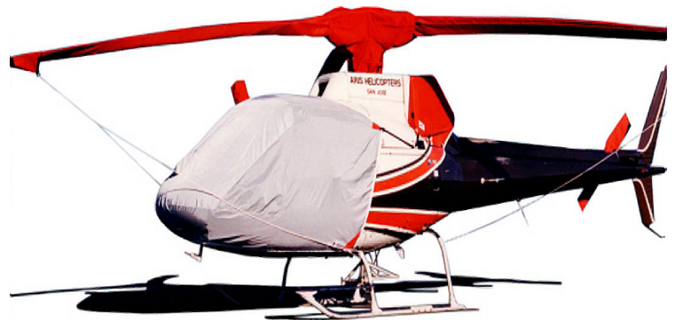
Bubble Cover, Intake/Exhaust, Rotor Mast, Tail Rotor & Main Body Covers