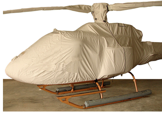
AS350 Main Body, Rotor Head, Blades and Tailboom Covers