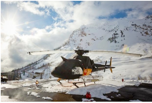
AS350 Insulated Bubble, Engine & Rotor Hub Covers