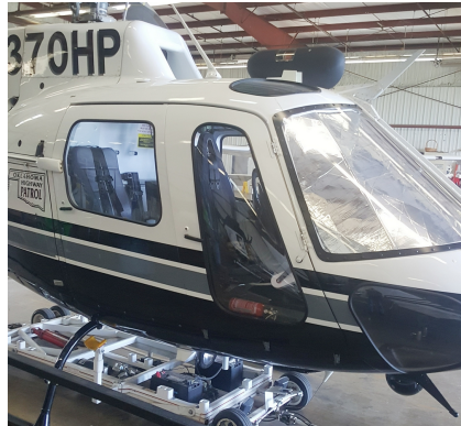
Aerospatiale AS350 Astar, Ecureuil, Esquilo, Fenec Windshield Heatshields

Heatshields are interior sunshades for an aircraft's windows or canopy glass. The product is a unique composite of closed-cell foam with a silver mylar finish. The semi-rigid design is stiff enough to stand along the inside of the windshield using sun visors or window framing. It folds up flat and easily stores in the included storage sleeve. Some designs may require velcro and suction cups. A Heatshield is an excellent short-term remedy for cockpit overheating.