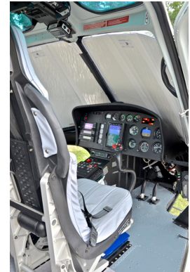
AS350 Windshield HeatShields