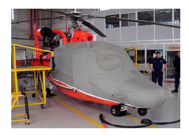
MH-65C Bubble Cover, extended Nose/Radome Model, padded over windows, P/N: A365-210

This cover type is made from Silver Acrylic Sunbrella canvas and is 100% lined with a soft and smooth microfiber. Bruce's Custom Covers developed this material combination especially for aircraft protection. The outer material is medium weight and treated for water resistance, UV resistance and anti-static buildup. The inner lining is a very soft and smooth microfiber to prevent scratching. The material is very reflective, and tests show that the cabin interior temperature can be reduced to near-ambient temperature on the hottest of days. It is water, ice and snow repellent, yet breathable to allow moisture to escape from between the cover and the aircraft surface.