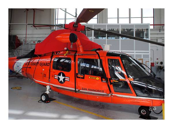
MH-65C Engine Area Cover, Swash Plate Aperture, Rotor Hub cover set, P/N: A365-210

Insulated Covers Material - A special composite material of solution-dyed polyester, 3M Thinsulate insulation, and soft nylon interior fabric. Our insulated covers are designed to complement an engine preheater and help retain heat in the engine compartment after shutdown. If you operate your aircraft in cold-weather, these covers will help prevent engine wear and tear.