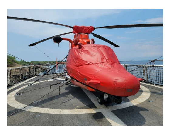
Aerospatiale AS365N2 Bubble, w/Extended Nose/Radome