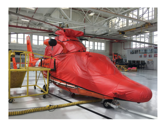
U.S. Coast Guard HH-65 Dolphin Bubble, Engine & Rotor Mast Covers