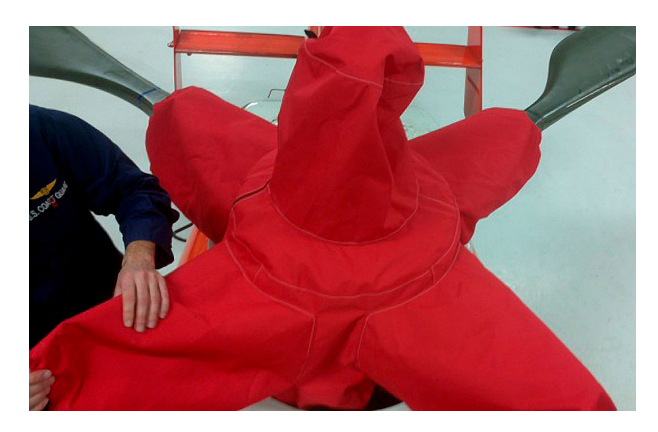
MH-65C Rotor Hub Cover w/ OADS Tube Cover detail