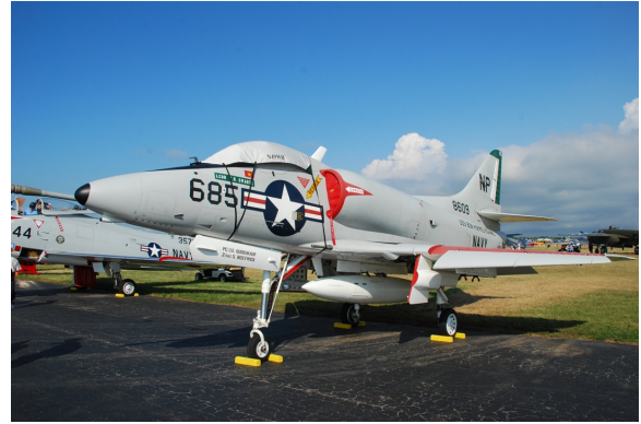
A-4 Skyhawk Canopy Cover