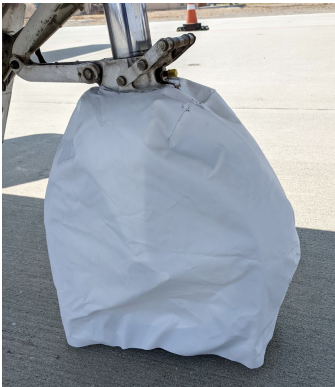
CJ1 Nose Gear Tire Cover, test fit