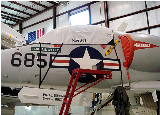
A-4 Skyhawk Canopy Cover