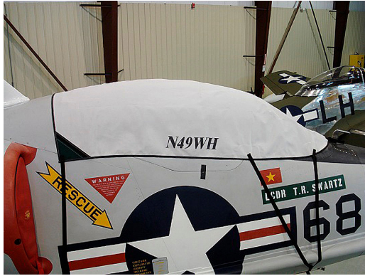
A-4 Skyhawk Canopy Cover

Travel Covers are made with Silver Solution-Dyed Polyester fabric and only lined over the windshield to save weight. The material is lightweight and more compact for easy stowage in the aircraft. The polyester material is water resistant, but only intended for occasional use outside. We also have an ultra lightweight material available for fitted hangar dust covers. For daily outdoor use, the non-travel Sunbrella Cover is the best choice.