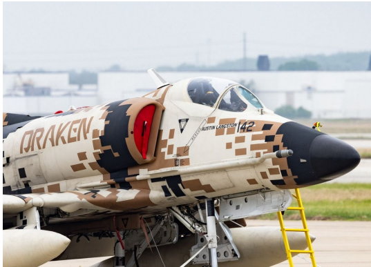
McDonnell Douglas A4 Skyhawk Engine Intake Plugs

The Engine Inlet Plugs are custom fit for your McDonnell Douglas A-4 Skyhawk, single & tandem intakes, made with heavy-duty vinyl material, and stuffed with a single block of sculpted urethane foam. Each plug has a zipper that allows the foam to be removed and dried if necessary. Engine plugs have 'remove before flight' streamers sewn onto the face of the plugs. Most plugs are imprinted with the aircraft registration number in black for an extra charge. Storage bag NOT included. Engine plugs may be inserted after flight when the engine is still warm. Engine Inlet Plugs are commonly referred to as Cowl Plugs, Intake Plugs, Cowl Blocks, Engine Blocks, and Engine Bungs.