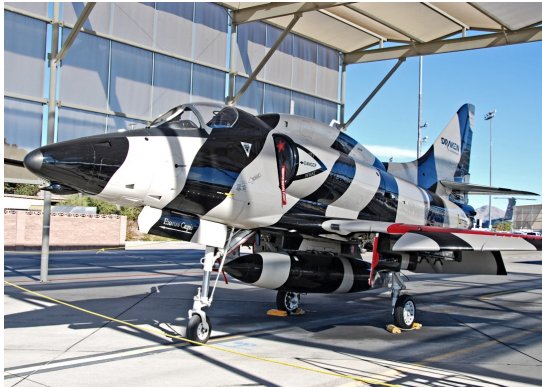
A4 Skyhawk Engine Inlet Plugs