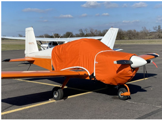
AA-1 Extended Canopy & Fully Enclosed Engine Cover

This cover type is made from Silver Acrylic Sunbrella canvas and is 100% lined with a soft and smooth microfiber. Bruce's Custom Covers developed this material combination especially for aircraft protection. The outer material is medium weight and treated for water resistance, UV resistance and anti-static buildup. The inner lining is a very soft and smooth microfiber to prevent scratching. The material is very reflective, and tests show that the cabin interior temperature can be reduced to near-ambient temperature on the hottest of days. It is water, ice and snow repellent, yet breathable to allow moisture to escape from between the cover and the aircraft surface.