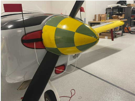
Grumman AA-1B Engine Inlet Plugs (set of 3)

and dried if necessary. Engine plugs have warning flags that are visible from the cockpit or 'remove before flight' streamers sewn onto the face of the plugs. Most plugs are imprinted with the aircraft registration number in black for an extra charge. Storage bag NOT included. Engine plugs may be inserted after flight when the engine is still warm. Engine Inlet Plugs are commonly referred to as Cowl Plugs, Intake Plugs, Cowl Blocks, Engine Blocks, and Engine Bungs.