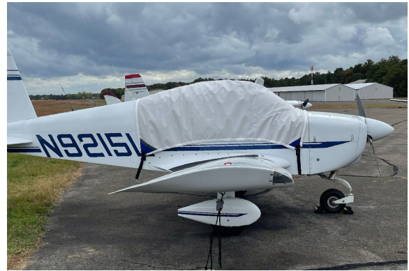
Grumman AA-1 Canopy Cover