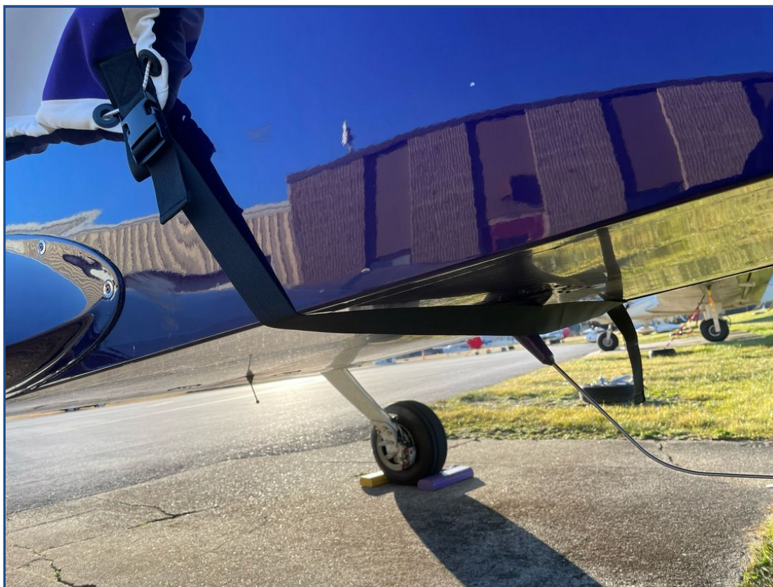
Grumman AA-1A Canopy Cover