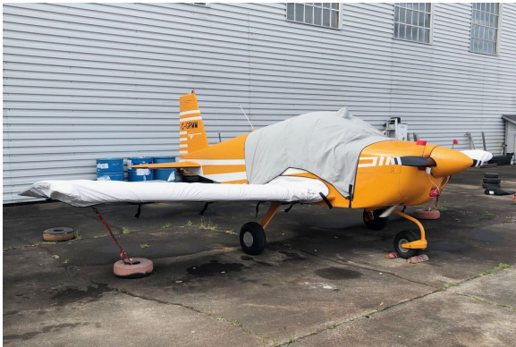
Grumman AA1B Yankee Wing Covers & Engine Inlet Plugs