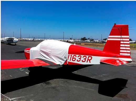
Grumman AA1 Extended Canopy Cover