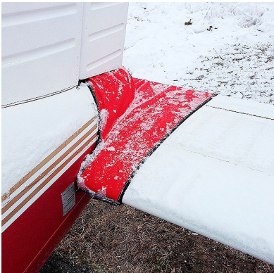
Piper PA-28 Tailcone Cover

WINTER USE MATERIAL - Made with Solution-Dyed Polyester fabric, this option is intended for seasonal use to aid in deicing, rain mitigation, or for occasional travel. The material is lighter and more compact, but more susceptible to UV damage and may have a shorter useful life if used continuously outside than the all-year use material.