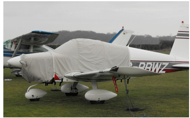
Grumman AA1 Extended Canopy Cover, Engine Cover