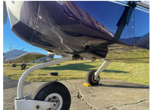
Grumman AA-1A Canopy Cover