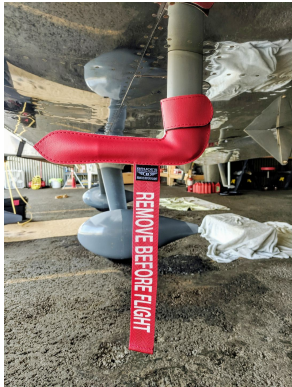
Van's RV-14 Pitot Cover