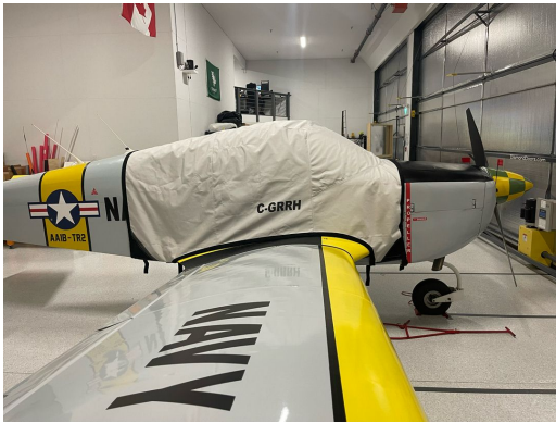
Grumman AA-1B Extended Canopy Cover

This cover type is made from Silver Acrylic Sunbrella canvas and is 100% lined with a soft and smooth microfiber. Bruce's Custom Covers developed this material combination especially for aircraft protection. The outer material is medium weight and treated for water resistance, UV resistance and anti-static buildup. The inner lining is a very soft and smooth microfiber to prevent scratching. The material is very reflective, and tests show that the cabin interior temperature can be reduced to near-ambient temperature on the hottest of days. It is water, ice and snow repellent, yet breathable to allow moisture to escape from between the cover and the aircraft surface.