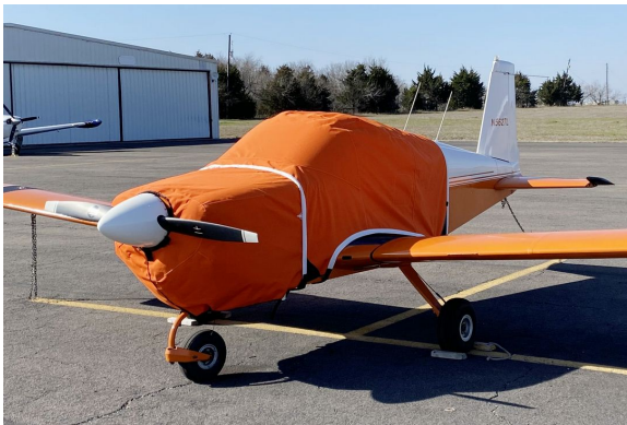
AA-1 Extended Canopy & Fully Enclosed Engine Cover

This cover type is made from Silver Acrylic Sunbrella canvas and is 100% lined with a soft and smooth microfiber. Bruce's Custom Covers developed this material combination especially for aircraft protection. The outer material is medium weight and treated for water resistance, UV resistance and anti-static buildup. The inner lining is a very soft and smooth microfiber to prevent scratching. The material is very reflective, and tests show that the cabin interior temperature can be reduced to near-ambient temperature on the hottest of days. It is water, ice and snow repellent, yet breathable to allow moisture to escape from between the cover and the aircraft surface.