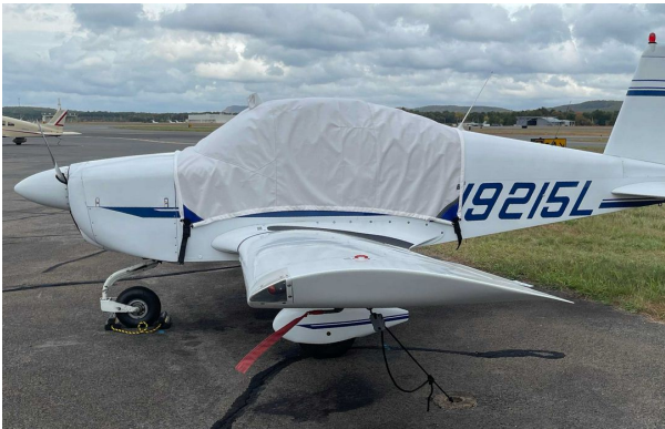
Grumman AA-1A Canopy Cover

This cover type is made from Silver Acrylic Sunbrella canvas and is 100% lined with a soft and smooth microfiber. Bruce's Custom Covers developed this material combination especially for aircraft protection. The outer material is medium weight and treated for water resistance, UV resistance and anti-static buildup. The inner lining is a very soft and smooth microfiber to prevent scratching. The material is very reflective, and tests show that the cabin interior temperature can be reduced to near-ambient temperature on the hottest of days. It is water, ice and snow repellent, yet breathable to allow moisture to escape from between the cover and the aircraft surface.