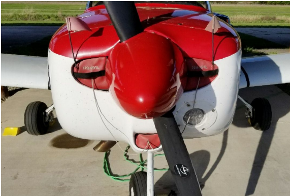
Grumman AA-1 Engine Inlet Plugs

and dried if necessary. Engine plugs have warning flags that are visible from the cockpit or 'remove before flight' streamers sewn onto the face of the plugs. Most plugs are imprinted with the aircraft registration number in black for an extra charge. Storage bag NOT included. Engine plugs may be inserted after flight when the engine is still warm. Engine Inlet Plugs are commonly referred to as Cowl Plugs, Intake Plugs, Cowl Blocks, Engine Blocks, and Engine Bungs.