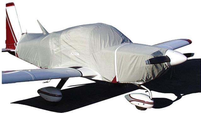
Grumman AA-5 Extended Canopy Cover & Engine Cover