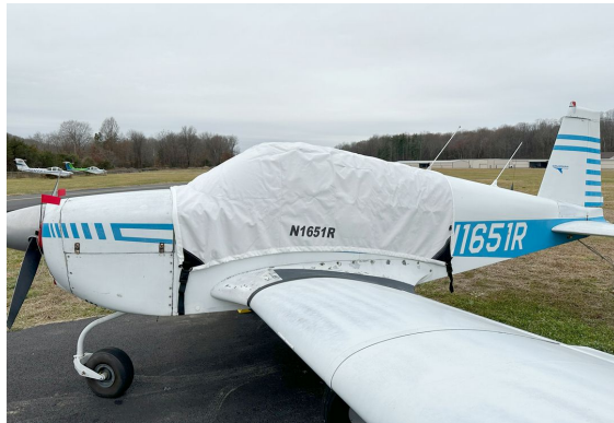
Grumman AA1 Canopy Cover

This cover type is made from Silver Acrylic Sunbrella canvas and is 100% lined with a soft and smooth microfiber. Bruce's Custom Covers developed this material combination especially for aircraft protection. The outer material is medium weight and treated for water resistance, UV resistance and anti-static buildup. The inner lining is a very soft and smooth microfiber to prevent scratching. The material is very reflective, and tests show that the cabin interior temperature can be reduced to near-ambient temperature on the hottest of days. It is water, ice and snow repellent, yet breathable to allow moisture to escape from between the cover and the aircraft surface.