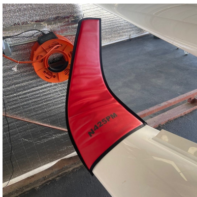
Stemme S-10 & S-12 Wingtip Pads

Designed to prevent damage to the wingtip in crowded hangars or high traffic areas, these products are made of bright red Naugahyde and thickly padded with a sandwich of closed cell foam. Protects delicate winglets, casters and their housings, and soft finishes.