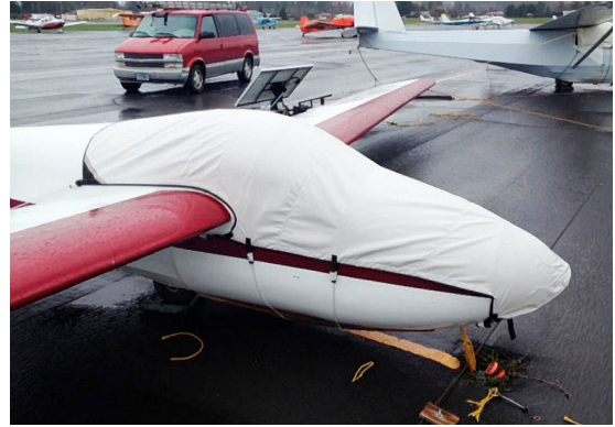
SGS 1-26B Canopy/Nose Cover