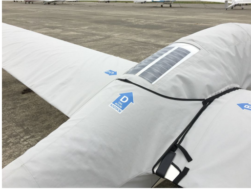
DG-505 Full Cover Set