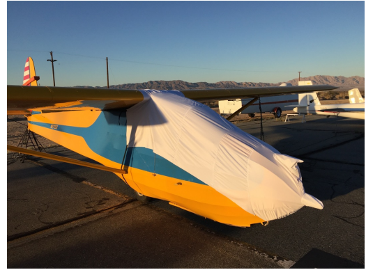
Sailplane Full Cover Set Graphic Indicators (Discus 2B, 3D model) Schweizer SGU 2-22EK Canopy/Nose Cover, test fit cover