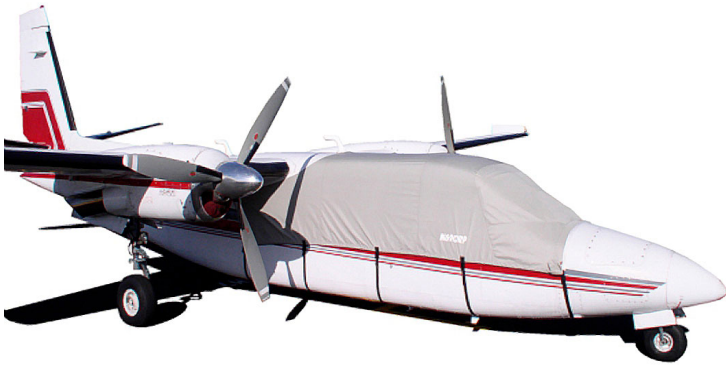
Aero Commander 690b Canopy Cover