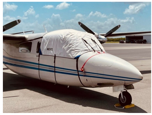
Aero Commander 690C Cockpit Cover