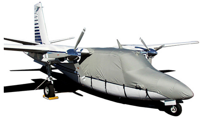
Aero Commander 500S Canopy/Nose Cover