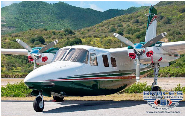
Aero Commander 500 Engine Inlet Plugs