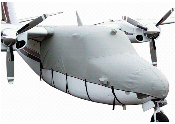
Canopy/Nose Cover (extends over top past leading edge)