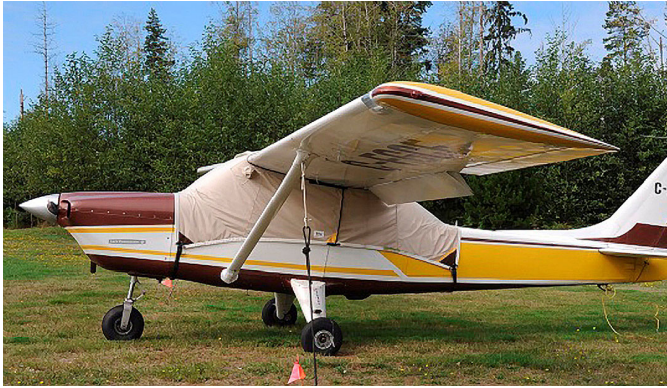
Lark Canopy Cover