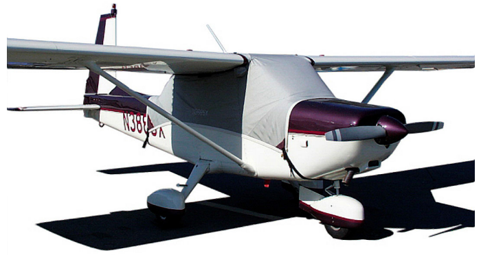
Lark Canopy Cover