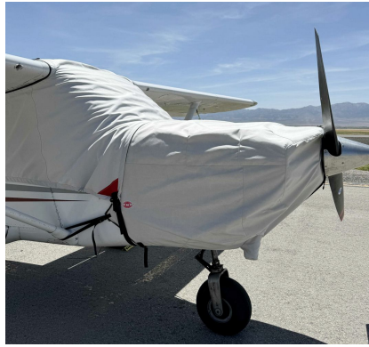
Aero Commander Lark Engine Cover

the hottest of days. It is water, ice and snow repellent, yet breathable to allow moisture to escape from between the cover and the aircraft surface.