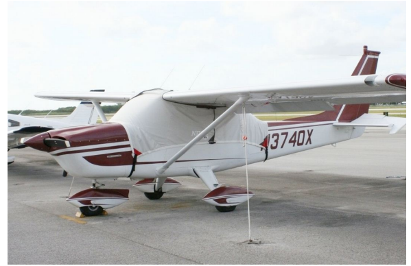
Rockwell Lark Commander Canopy Cover