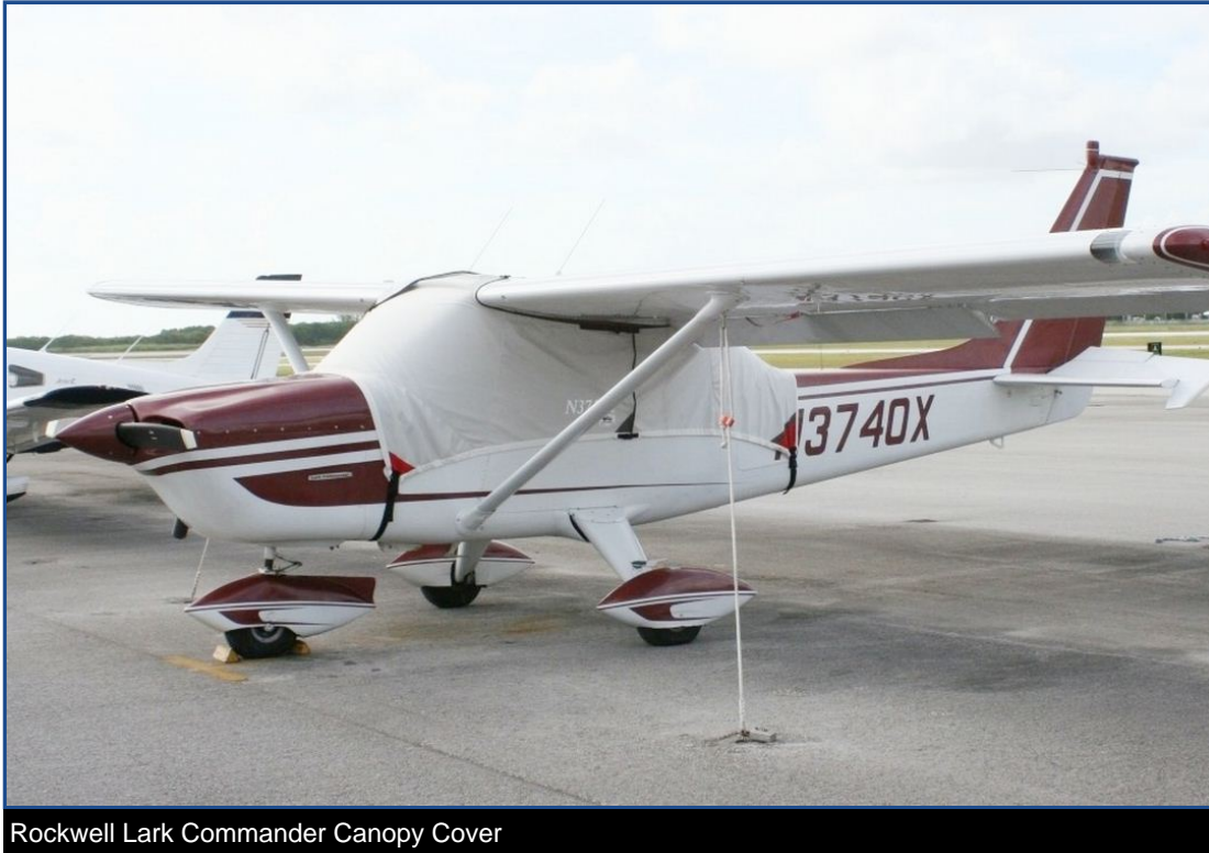
Rockwell Lark Commander Canopy Cover