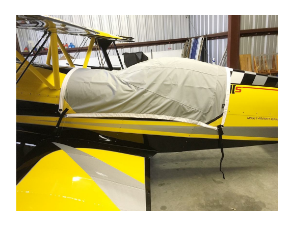
Acro Sport Acro II, Acroduster Travel Cover, Light Weight Travel Canopy Cover