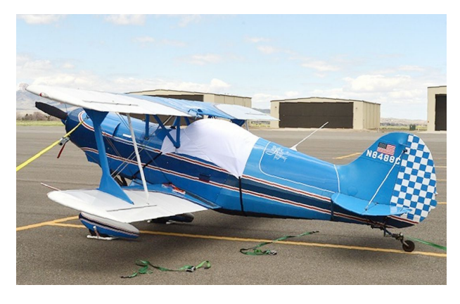
Acro Sport Canopy Cover