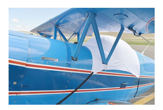
Acro Sport Canopy Cover