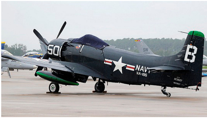
Douglas Skyraider Canopy Cover