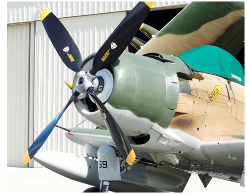
Douglas Skyraider Canopy Cover