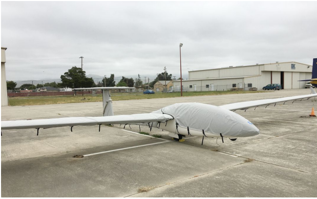
DG-505 Canopy/Nose, Wing, Empennage & Horiz. Stab. Covers

the hottest of days. It is water, ice and snow repellent, yet breathable to allow moisture to escape from between the cover and the aircraft surface.