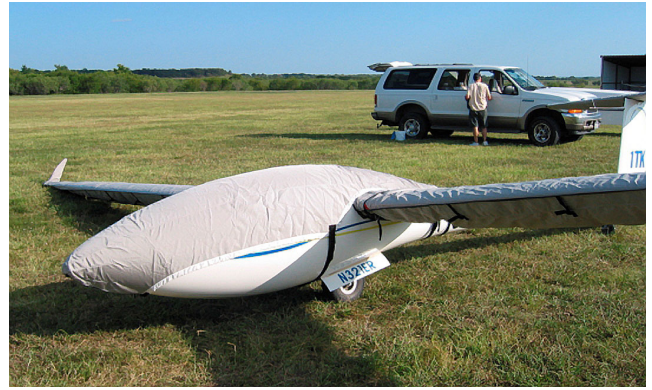
Canopy/Nose Cover, Wings and Horizontal Stab Covers