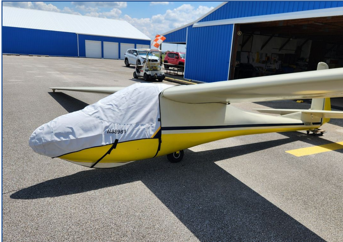
Aer-Pegaso M-100S Canopy/Nose Cover