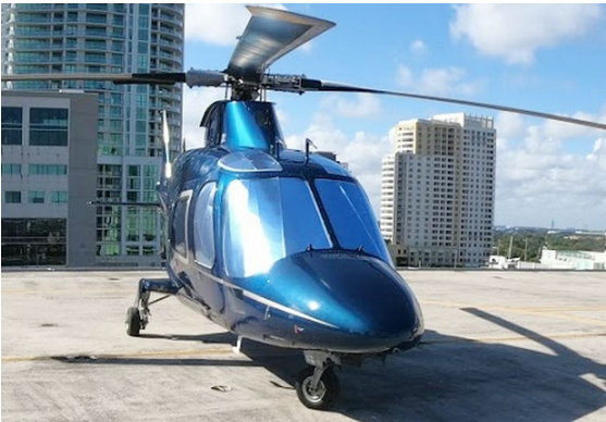
Agusta AW109 Power, A109E Heatshield Set