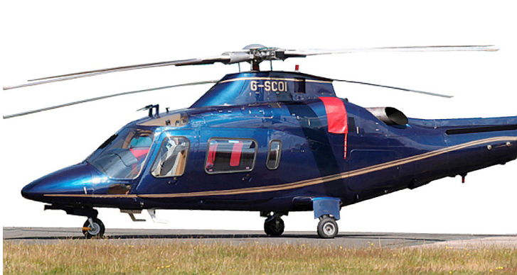
Agusta Power Intake Cover