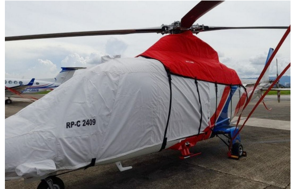
Agusta Grand AW109 SP Bubble & Engine Covers