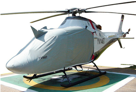
Koala Bubble Cover (with Wire Strike)

Travel Covers are made with Silver Solution-Dyed Polyester fabric and fully lined over the entire cover. The material is lightweight and more compact for easy storage in the aircraft. The polyester material is water resistant, but only intended for occasional use outside. We also have an ultra lightweight material available for fitted hangar dust covers. For daily outdoor use, the non-travel Sunbrella Cover is the best choice.