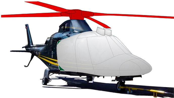
Agusta 109 Bubble, Rotor Hub & Blade Covers (illustration)