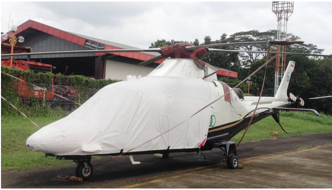
Agusta AW109S/SP Grand, Grand New Bubble Cover