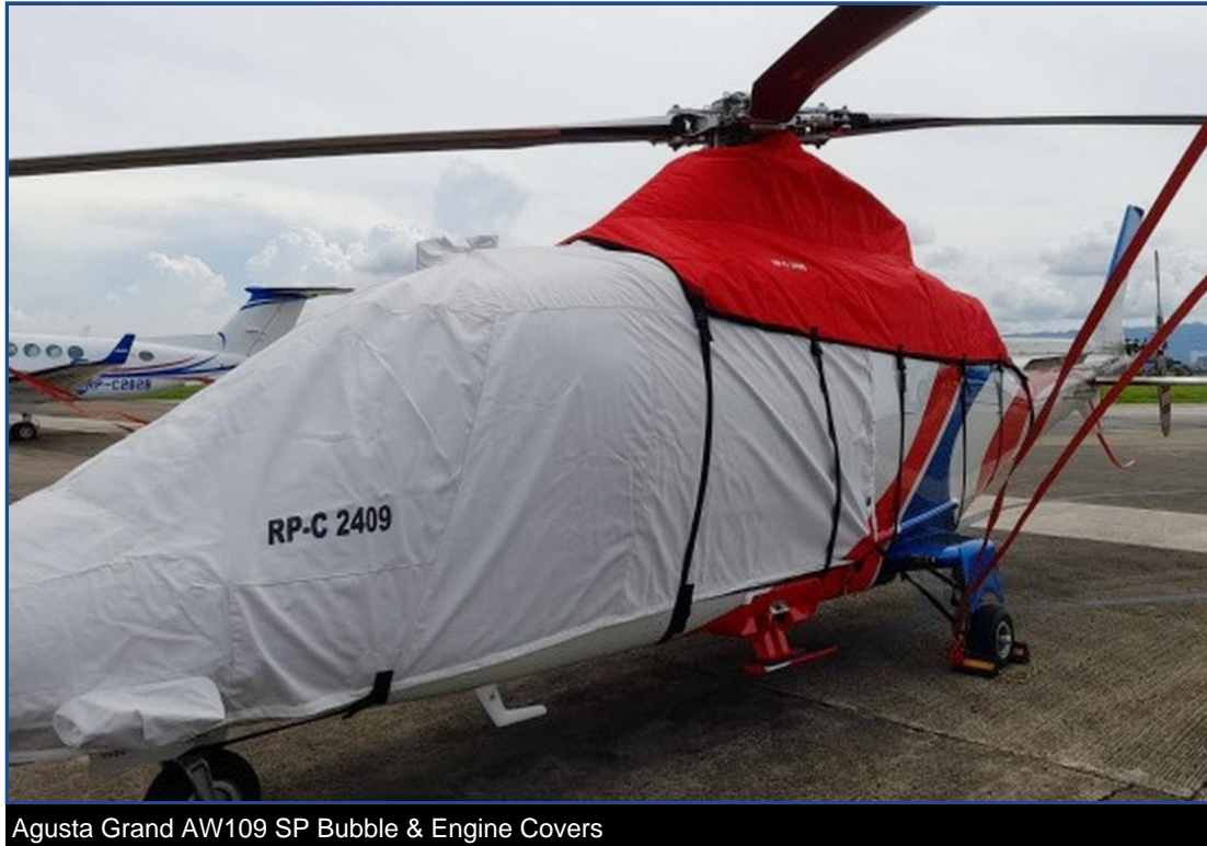
Agusta Grand AW109 SP Bubble &amp; Engine Covers