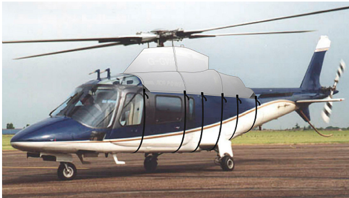
Agusta Power Engine Cover (illustration)

WINTER USE MATERIAL - Made with Solution-Dyed Polyester fabric, this option is intended for seasonal use to aid in deicing, rain mitigation, or for occasional travel. The material is lighter and more compact, but more susceptible to UV damage and may have a shorter useful life if used continuously outside than the all-year use material.