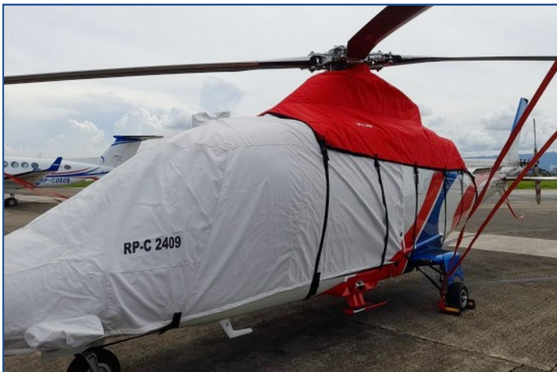
Agusta Grand AW109 SP Bubble &amp; Engine Covers