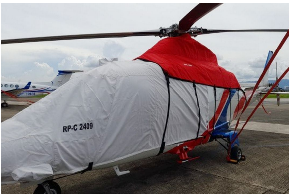
Agusta Grand AW109 SP Bubble & Engine Covers