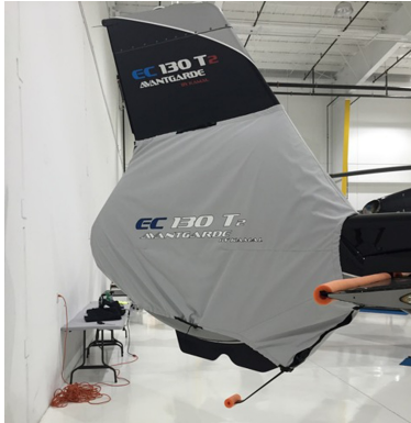
EC-130 Tailfan Cover

The Tailboom Cover details vary by model, but generally the helicopter tail boom cover encloses the tail boom from the "bottleneck" to the aft end. They usually also cover the horizontal stabilizers, and are custom made to allow for antennae, lights, and other protrusions. They attach with straps underneath the tail boom. Covers for the vertical and horizontal stabilizers are also available separately. Specific information for each model is available on request.