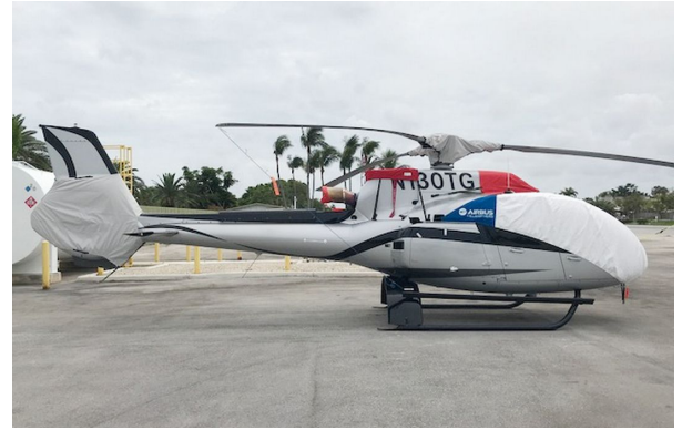
AIRBUS H130 T2, Intake, Exhaust & Tailfan Covers