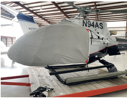
Airbus H-130 Bubble Cover, Travel Weight