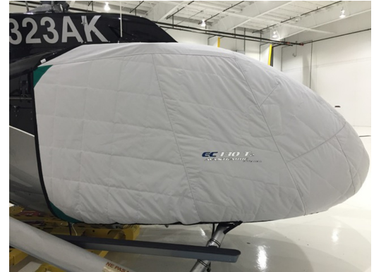
EC-130 Insulated Bubble Cover