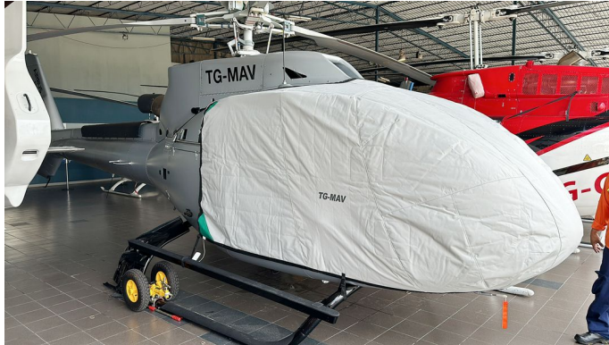
Airbus H-130 Insulated Bubble Cover

This cover type is made from Silver Acrylic Sunbrella canvas and is 100% lined with a soft and smooth microfiber. Bruce's Custom Covers developed this material combination especially for aircraft protection. The outer material is medium weight and treated for water resistance, UV resistance and anti-static buildup. The inner lining is a very soft and smooth microfiber to prevent scratching. The material is very reflective, and tests show that the cabin interior temperature can be reduced to near-ambient temperature on the hottest of days. It is water, ice and snow repellent, yet breathable to allow moisture to escape from between the cover and the aircraft surface.