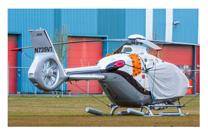
Airbus EC135T3 Blade Tie-Downs