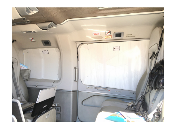
Aerospatiale AS350 Astar, Ecureuil, Esquilo, Fennec Windshield Heatshields