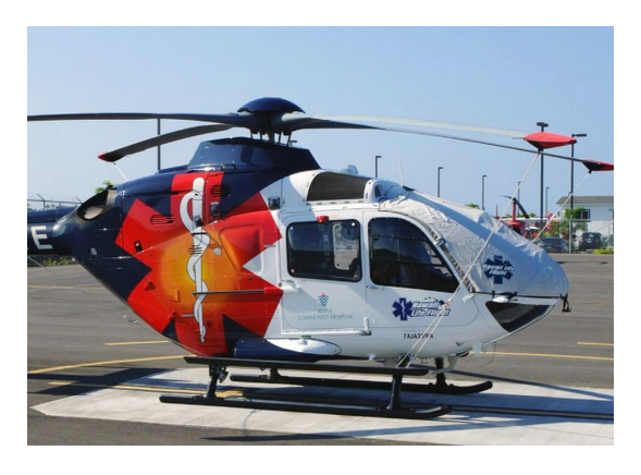
Eurocopter EC-135 Windshield/Skylight Cover

This cover type is made from Silver Acrylic Sunbrella canvas and is 100% lined with a soft and smooth microfiber. Bruce's Custom Covers developed this material combination especially for aircraft protection. The outer material is medium weight and treated for water resistance, UV resistance and anti-static buildup. The inner lining is a very soft and smooth microfiber to prevent scratching. The material is very reflective, and tests show that the cabin interior temperature can be reduced to near-ambient temperature on the hottest of days. It is water, ice and snow repellent, yet breathable to allow moisture to escape from between the cover and the aircraft surface.