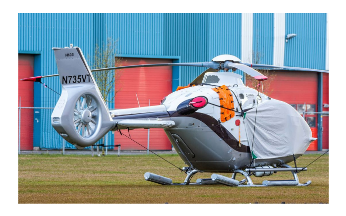
Airbus EC135T3 Blade Tie-Downs