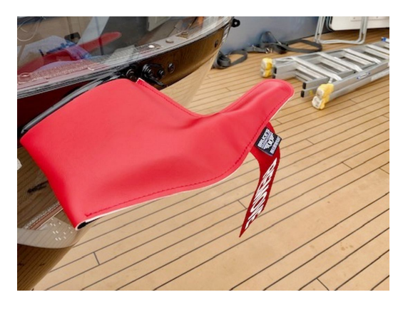
Airbus Helicopter H145 Pitot Tube Cover