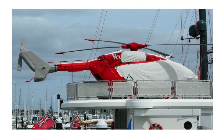
Eurocopter EC-135 Bubble, Engine, Rotor Hub, Tail Surfaces Covers

The Tailboom Cover details vary by model, but generally the helicopter tail boom cover encloses the tail boom from the "bottleneck" to the aft end. They usually also cover the horizontal stabilizers, and are custom made to allow for antennae, lights, and other protrusions. They attach with straps underneath the tail boom. Covers for the vertical and horizontal stabilizers are also available separately. Specific information for each model is available on request.