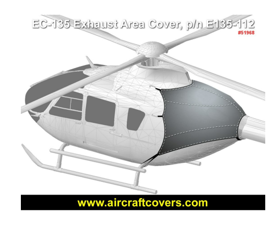
EC135 Exhaust Area Cover, illustration