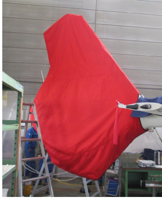
Airbus EC145 Tailfan Housing Fenestron Cover

The Tailboom Cover details vary by model, but generally the helicopter tail boom cover encloses the tail boom from the "bottleneck" to the aft end. They usually also cover the horizontal stabilizers, and are custom made to allow for antennae, lights, and other protrusions. They attach with straps underneath the tail boom. Covers for the vertical and horizontal stabilizers are also available separately. Specific information for each model is available on request.