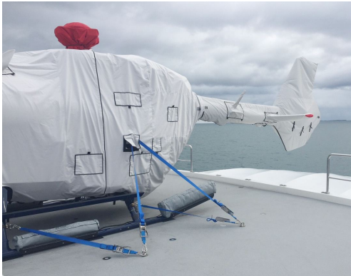
Eurocopter EC-145 D2 Main Body Cover, Tailboom/Fenestron Cover