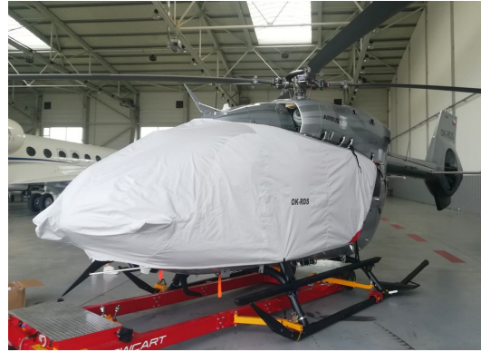
EC-135 Windshield/Skylights Cover, pinches in door jambs Airbus Helicopter EC-145 Bubble Cover with Radome & Wire Strike