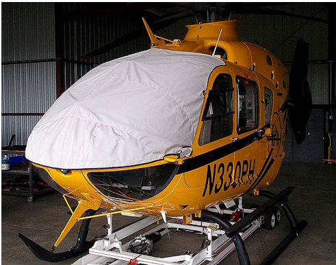
Eurocopter EC-145 D2 Main Body Cover, Tailboom/Fenestron Cover EC-135 Windshield/Skylights Cover, pinches in door jambs