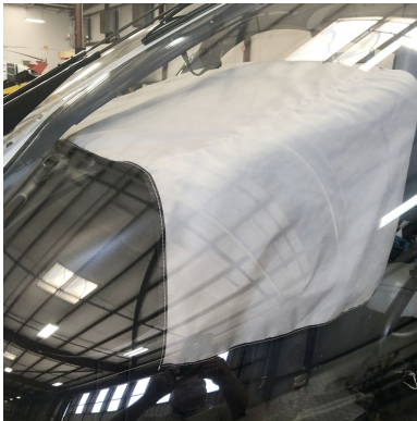
Eurocopter EC-135 Instrument Panel Heatshield Cover

Heatshields are interior sunshades for an aircraft's windows or canopy glass. The product is a unique composite of closed-cell foam with a silver mylar finish. The semi-rigid design is stiff enough to stand along the inside of the windshield using sun visors or window framing. It folds up flat and easily stores in the included storage sleeve. Some designs may require velcro and suction cups. A Heatshield is an excellent short-term remedy for cockpit overheating.