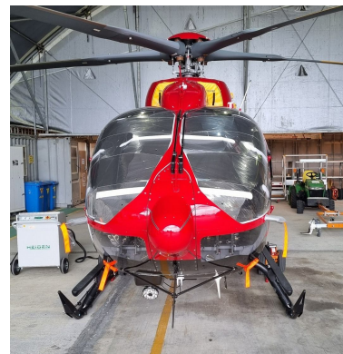
Airbus Helicopter H145D3 Windshield Heatshields, Engine Plugs