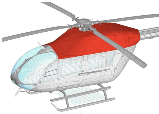
Intake/Exhaust Engine Area Cover, 3D Rendering

The Engine Inlet Plugs are custom fit for your Airbus Helicopter EC-145, UH-145, BK-117 D-2 intakes, made with heavy-duty vinyl material, and stuffed with a single block of sculpted urethane foam. Each plug has a zipper that allows the foam to be removed and dried if necessary. Engine plugs have 'Remove Before Flight' streamers sewn onto the face of the plugs. Most plugs are imprinted with the aircraft registration number in black for an extra charge. Storage bag NOT included. Engine plugs may be inserted after flight when the engine is still warm. Engine Inlet Plugs are commonly referred to as Cowl Plugs, Intake Plugs, Cowl Blocks, Engine Blocks, and Engine Bungs.