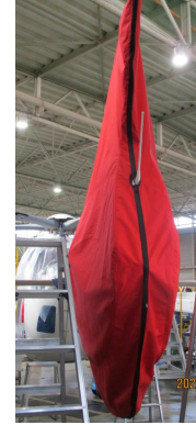
Airbus EC145 Tailfan Housing Fenestron Cover