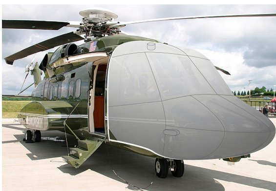
Sikorsky S-92 Windshield/Nose Cover (illustration)

This cover type is made from Silver Acrylic Sunbrella canvas and is 100% lined with a soft and smooth microfiber. Bruce's Custom Covers developed this material combination especially for aircraft protection. The outer material is medium weight and treated for water resistance, UV resistance and anti-static buildup. The inner lining is a very soft and smooth microfiber to prevent scratching. The material is very reflective, and tests show that the cabin interior temperature can be reduced to near-ambient temperature on the hottest of days. It is water, ice and snow repellent, yet breathable to allow moisture to escape from between the cover and the aircraft surface.