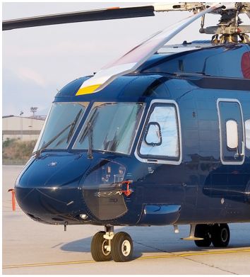
Sikorsky S-92 Cockpit HeatShields