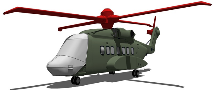
Sikorsky S-92 Windshield/Nose, Blade, Rotor Hub & Tail Rotor Covers