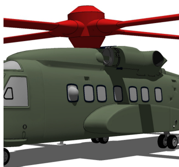
Sikorsky S-92 Main Rotor Hub Cover

WINTER USE MATERIAL - Made with Solution-Dyed Polyester fabric, this option is intended for seasonal use to aid in deicing, rain mitigation, or for occasional travel. The material is lighter and more compact, but more susceptible to UV damage and may have a shorter useful life if used continuously outside than the all-year use material.