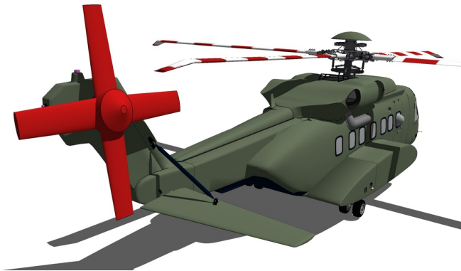
Sikorsky S-92 Tail Rotor Blade and Hub Covers

WINTER USE MATERIAL - Made with Solution-Dyed Polyester fabric, this option is intended for seasonal use to aid in deicing, rain mitigation, or for occasional travel. The material is lighter and more compact, but more susceptible to UV damage and may have a shorter useful life if used continuously outside than the all-year use material.