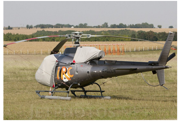
Airbus Helicopter AS350 Bubble Cover & Intake/Exhaust Cover