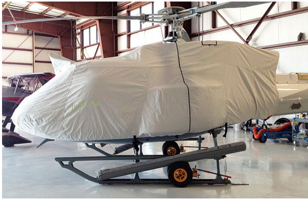
AS350 B3 Main Body Cover (Covers Bubble/Cabin, Engine Area and Exhaust)