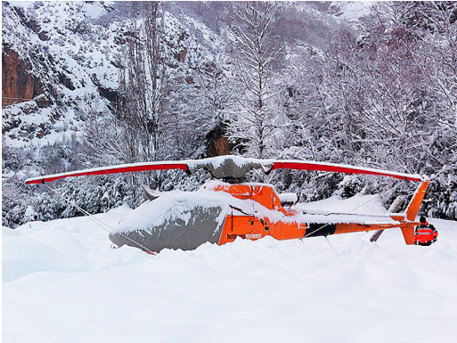
AS350 Bubble Cover, Insulated Main & Tail Rotor Covers, Blade Covers with tid-down detail

WINTER USE MATERIAL - Made with Solution-Dyed Polyester fabric, this option is intended for seasonal use to aid in deicing, rain mitigation, or for occasional travel. The material is lighter and more compact, but more susceptible to UV damage and may have a shorter useful life if used continuously outside than the all-year use material.