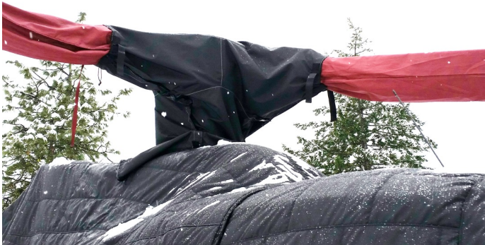
Main Rotor Hub Cover with swash plate extension.