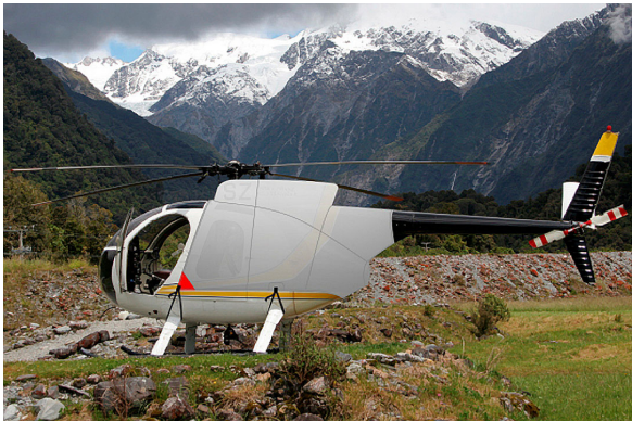
Engine Cover (illustration)