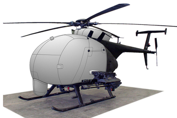
MH-6J Bubble, Flir & Doghouse Covers (illustration)