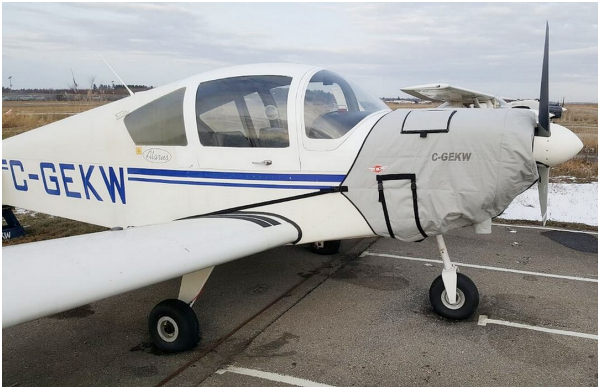
Alarus CH-2000 Insulated Engine Cover

This cover type is made from Silver Acrylic Sunbrella canvas and is 100% lined with a soft and smooth microfiber. Bruce's Custom Covers developed this material combination especially for aircraft protection. The outer material is medium weight and treated for water resistance, UV resistance and anti-static buildup. The inner lining is a very soft and smooth microfiber to prevent scratching. The material is very reflective, and tests show that the cabin interior temperature can be reduced to near-ambient temperature on the hottest of days. It is water, ice and snow repellent, yet breathable to allow moisture to escape from between the cover and the aircraft surface.