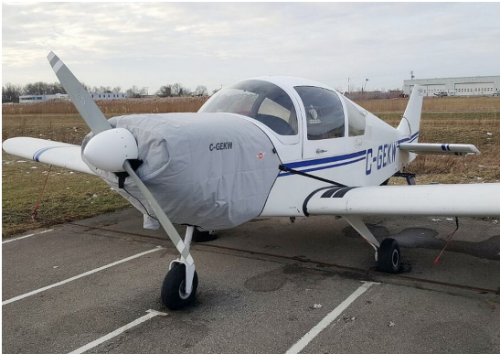
Alarus CH-2000 Insulated Engine Cover