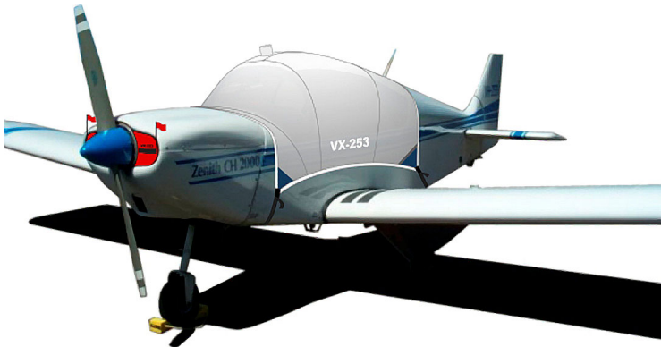
AMD Alarus CH2000 Std Canopy Cover & Engine Plugs (Illustration)