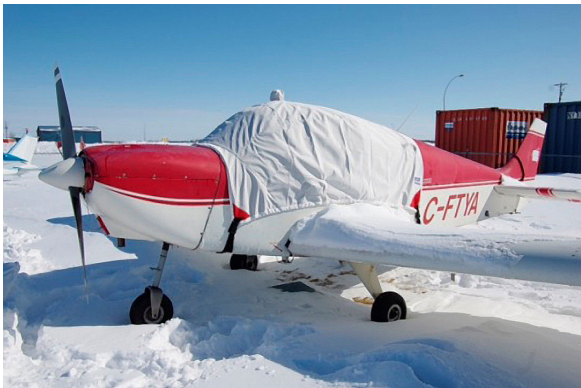
Alarus CH2000 Canopy Cover & Engine Plugs

This cover type is made from Silver Acrylic Sunbrella canvas and is 100% lined with a soft and smooth microfiber. Bruce's Custom Covers developed this material combination especially for aircraft protection. The outer material is medium weight and treated for water resistance, UV resistance and anti-static buildup. The inner lining is a very soft and smooth microfiber to prevent scratching. The material is very reflective, and tests show that the cabin interior temperature can be reduced to near-ambient temperature on the hottest of days. It is water, ice and snow repellent, yet breathable to allow moisture to escape from between the cover and the aircraft surface.