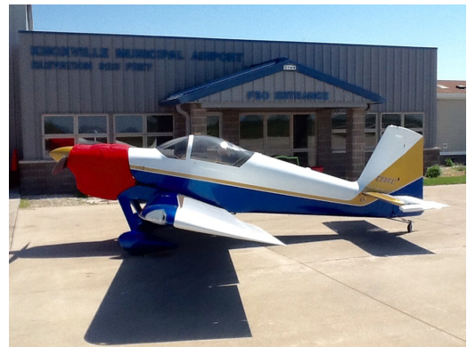
Van's RV-7 Insulated Engine Cover