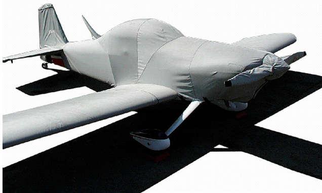
Van's RV-4 Complete Cover

This cover type is made from Silver Acrylic Sunbrella canvas and is 100% lined with a soft and smooth microfiber. Bruce's Custom Covers developed this material combination especially for aircraft protection. The outer material is medium weight and treated for water resistance, UV resistance and anti-static buildup. The inner lining is a very soft and smooth microfiber to prevent scratching. The material is very reflective, and tests show that the cabin interior temperature can be reduced to near-ambient temperature on the hottest of days. It is water, ice and snow repellent, yet breathable to allow moisture to escape from between the cover and the aircraft surface.