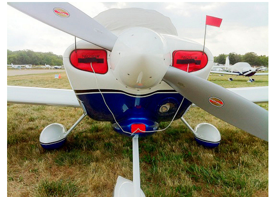
Van's RV-10 Canopy Cover & Engine Inlet Plugs