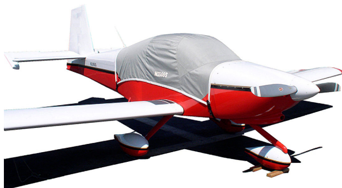
Van's RV-10 Canopy Cover

Travel Covers are made with Silver Solution-Dyed Polyester fabric and only lined over the windshield to save weight. The material is lightweight and more compact for easy stowage in the aircraft. The polyester material is water resistant, but only intended for occasional use outside. We also have an ultra lightweight material available for fitted hangar dust covers. For daily outdoor use, the non-travel Sunbrella Cover is the best choice.