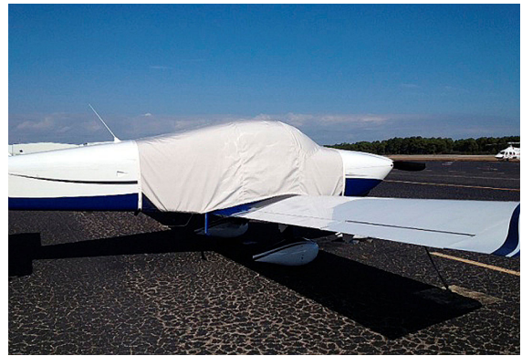
Van's RV-10 Extended Canopy Cover