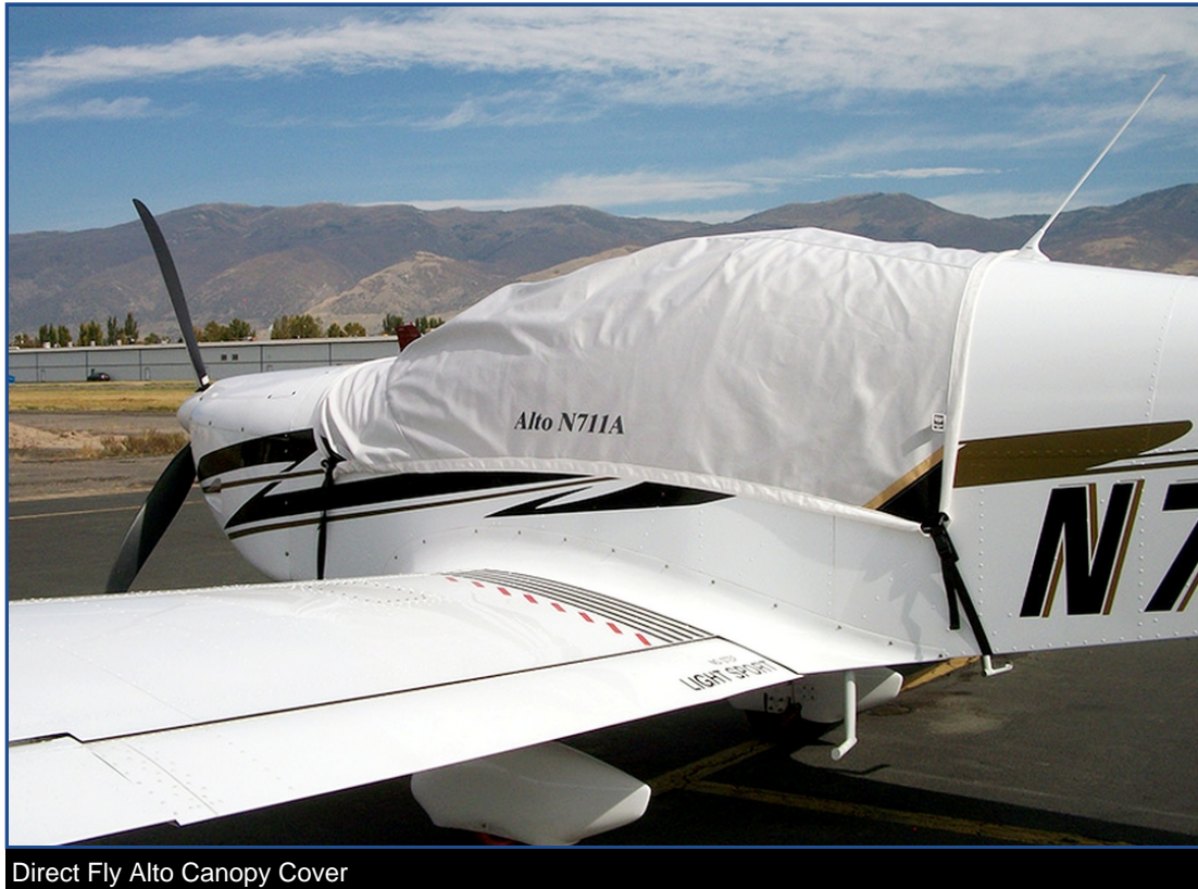
Direct Fly Alto Canopy Cover