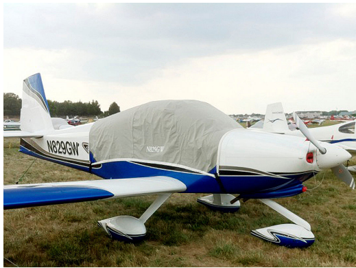
Van's RV-10 Canopy Cover & Engine Inlet Plugs

This cover type is made from Silver Acrylic Sunbrella canvas and is 100% lined with a soft and smooth microfiber. Bruce's Custom Covers developed this material combination especially for aircraft protection. The outer material is medium weight and treated for water resistance, UV resistance and anti-static buildup. The inner lining is a very soft and smooth microfiber to prevent scratching. The material is very reflective, and tests show that the cabin interior temperature can be reduced to near-ambient temperature on the hottest of days. It is water, ice and snow repellent, yet breathable to allow moisture to escape from between the cover and the aircraft surface.