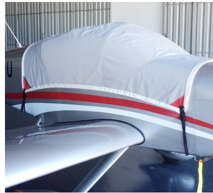
Vans's RV-9 Light Weight Travel Canopy Cover