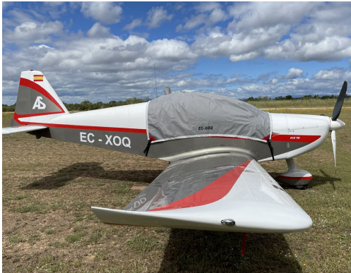
Direct Fly Alto Travel Cover, Light Weight Canopy Cover

Travel Covers are made with Silver Solution-Dyed Polyester fabric and only lined over the windshield to save weight. The material is lightweight and more compact for easy stowage in the aircraft. The polyester material is water resistant, but only intended for occasional use outside. We also have an ultra lightweight material available for fitted hangar dust covers. For daily outdoor use, the non-travel Sunbrella Cover is the best choice.