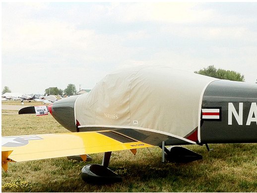
Van's RV-10 Canopy Cover

This cover type is made from Silver Acrylic Sunbrella canvas and is 100% lined with a soft and smooth microfiber. Bruce's Custom Covers developed this material combination especially for aircraft protection. The outer material is medium weight and treated for water resistance, UV resistance and anti-static buildup. The inner lining is a very soft and smooth microfiber to prevent scratching. The material is very reflective, and tests show that the cabin interior temperature can be reduced to near-ambient temperature on the hottest of days. It is water, ice and snow repellent, yet breathable to allow moisture to escape from between the cover and the aircraft surface.