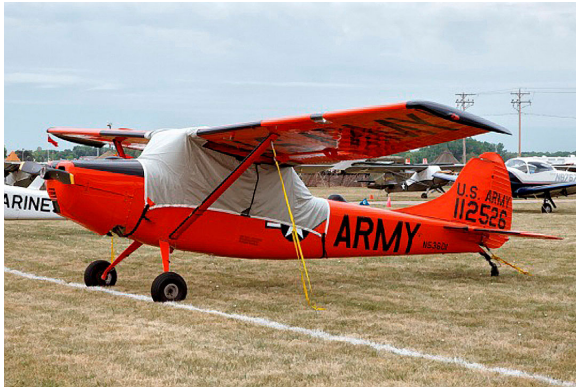
Cessna L-19 Bird Dog Canopy Cover

the hottest of days. It is water, ice and snow repellent, yet breathable to allow moisture to escape from between the cover and the aircraft surface.