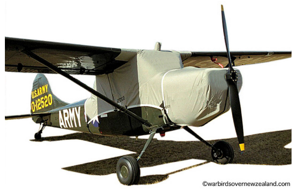
Cessna L-19 Canopy & Engine Covers