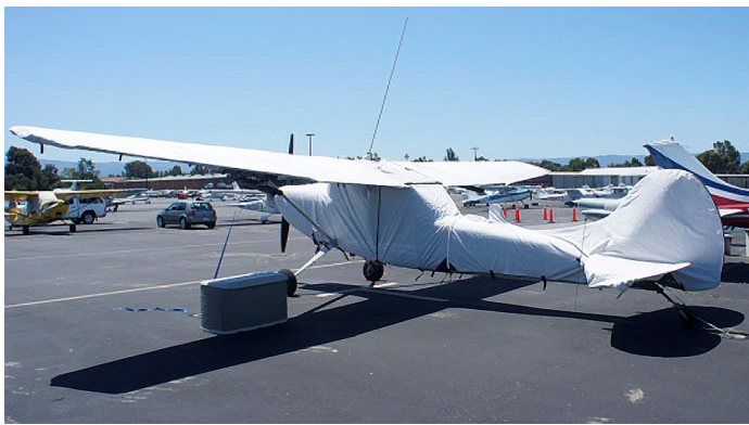
Cessna L-19 Extended Over-the-top Canopy, Engine, Empennage & Wing Cessna Bird Dog, L-19, O-1, 305 Canopy Cover, Over-Top Covers