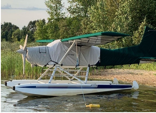
Cessna A185F Complete Cover Set

The material is very reflective, and tests show that the cabin interior temperature can be reduced to near-ambient temperature on the hottest of days. It is water, ice and snow repellent, yet breathable to allow moisture to escape from between the cover and the aircraft surface.