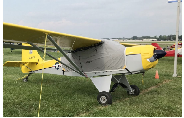
Kitfox Travel Canopy Cover