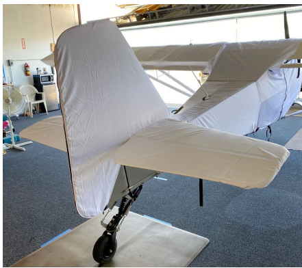
Kitfox Empennage Cover, test fit cover