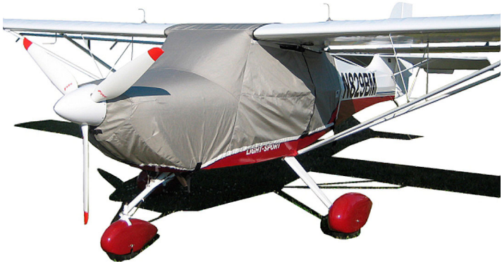
Aerotrek A240 Canopy/Engine Cover