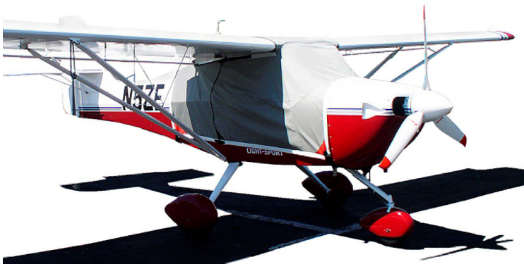
Aerotrek A240 Standard Canopy Cover

This cover type is made from Silver Acrylic Sunbrella canvas and is 100% lined with a soft and smooth microfiber. Bruce's Custom Covers developed this material combination especially for aircraft protection. The outer material is medium weight and treated for water resistance, UV resistance and anti-static buildup. The inner lining is a very soft and smooth microfiber to prevent scratching. The material is very reflective, and tests show that the cabin interior temperature can be reduced to near-ambient temperature on the hottest of days. It is water, ice and snow repellent, yet breathable to allow moisture to escape from between the cover and the aircraft surface.