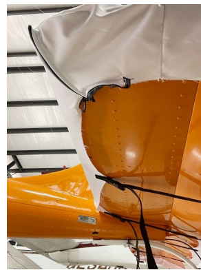
Aeromarine Merlin Horizontal Stabilizer Covers, test fit covers