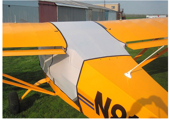
Aerotrek A240 Spandex FlyAway Travel Canopy Cover