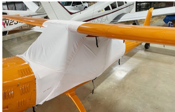
Aeromarine Merlin Over-Top Canopy Cover, test fit cover