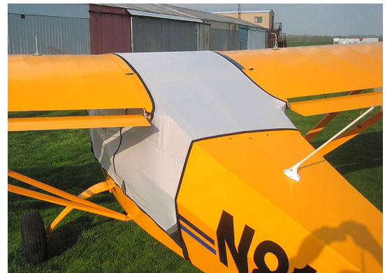
Aerotrek A240 Spandex FlyAway Travel Canopy Cover