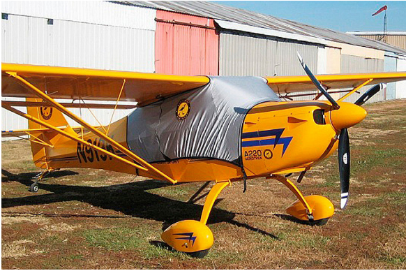
Aerotrek A220 Fitted Hangar Dust Cover

Travel Covers are made with Silver Solution-Dyed Polyester fabric and only lined over the windshield to save weight. The material is lightweight and more compact for easy stowage in the aircraft. The polyester material is water resistant, but only intended for occasional use outside. We also have an ultra lightweight material available for fitted hangar dust covers. For daily outdoor use, the non-travel Sunbrella Cover is the best choice.