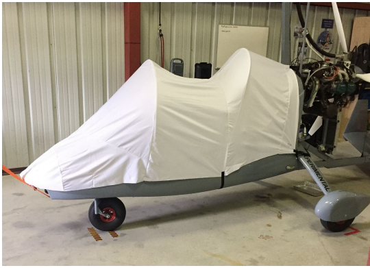
Magni M16 Autogyro Canopy/Nose Cover, test fit cover