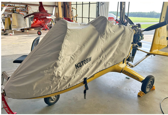
American Ranger AR-1 Gyrocopter Canopy/Nose Cover