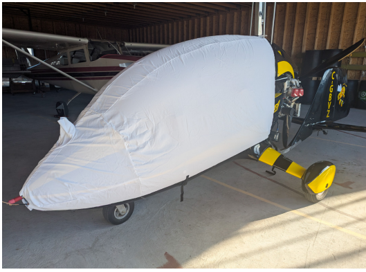
American Ranger AR-1 Gyrocopter Canopy/Nose Cover, enclosed cockpit