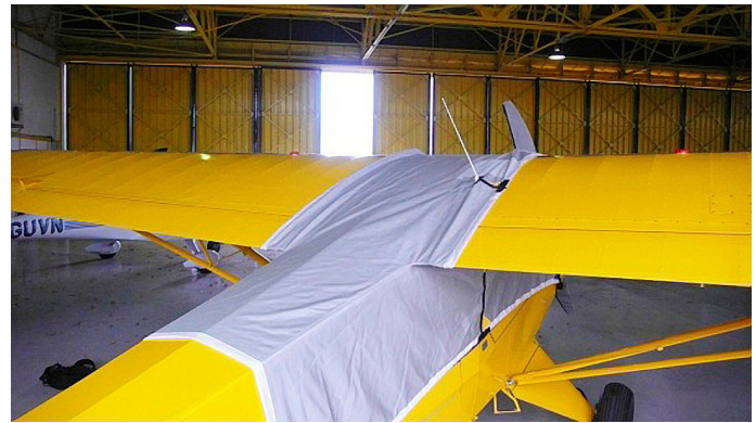
Aviat Husky Canopy Cover