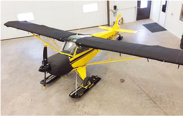
Aviat Husky Insulated Engine Cover, Wing Covers

WINTER USE MATERIAL - Made with Solution-Dyed Polyester fabric, this option is intended for seasonal use to aid in deicing, rain mitigation, or for occasional travel. The material is lighter and more compact, but more susceptible to UV damage and may have a shorter useful life if used continuously outside than the all-year use material.