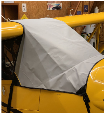
Cub Crafters Carbon Cub FX3 Windshield/Skylight Cover, travel weight