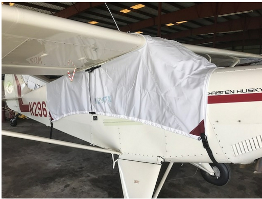
Aviat Husky Canopy Cover

This cover type is made from Silver Acrylic Sunbrella canvas and is 100% lined with a soft and smooth microfiber. Bruce's Custom Covers developed this material combination especially for aircraft protection. The outer material is medium weight and treated for water resistance, UV resistance and anti-static buildup. The inner lining is a very soft and smooth microfiber to prevent scratching. The material is very reflective, and tests show that the cabin interior temperature can be reduced to near-ambient temperature on the hottest of days. It is water, ice and snow repellent, yet breathable to allow moisture to escape from between the cover and the aircraft surface.