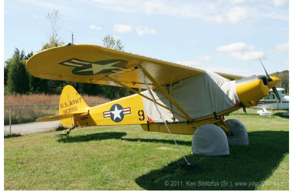
Piper L-21b Extended Canopy Cover, Tire Covers