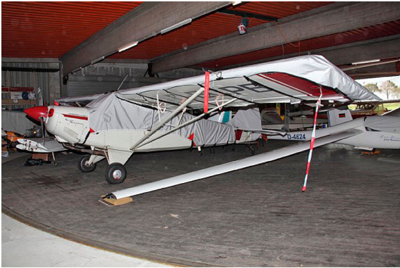
Aviat Husky Engine Plugs, Canopy, Wing & Empennage Covers

This cover type is made from Silver Acrylic Sunbrella canvas and is 100% lined with a soft and smooth microfiber. Bruce's Custom Covers developed this material combination especially for aircraft protection. The outer material is medium weight and treated for water resistance, UV resistance and anti-static buildup. The inner lining is a very soft and smooth microfiber to prevent scratching. The material is very reflective, and tests show that the cabin interior temperature can be reduced to near-ambient temperature on the hottest of days. It is water, ice and snow repellent, yet breathable to allow moisture to escape from between the cover and the aircraft surface.