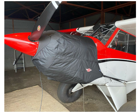
Aviat Husky Insulated Engine Cover