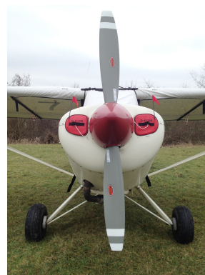
Aviat Husky Engine Plugs, Wing Covers