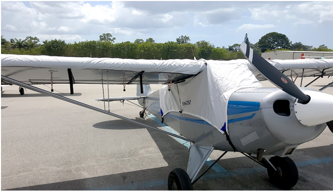
Aviat (Christen) Husky Canopy Cover (Over-The-Top Style)