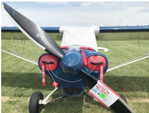
Cubcrafters CC-18 Engine Inlet Plugs

Engine Inlet Plugs are custom fit for your Lewaero Ascender intakes, made with heavy-duty vinyl material, and stuffed with a single block of sculpted urethane foam. Each plug has a zipper that allows the foam to be removed and dried if necessary. Engine plugs have warning flags that are visible from the cockpit or 'remove before flight' streamers sewn onto the face of the plugs. Most plugs are imprinted with the aircraft registration number in black for an extra charge. Storage bag NOT included. Engine plugs may be inserted after flight when the engine is still warm. Engine Inlet Plugs are commonly referred to as Cowl Plugs, Intake Plugs, Cowl Blocks, Engine Blocks, and Engine Bungs.