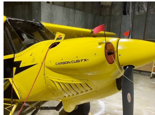
Cub Crafters CCX-2000 Engine Plugs