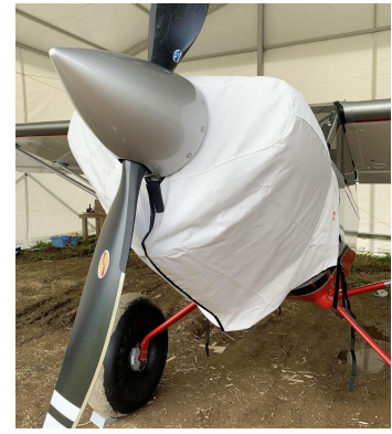
Cub Crafters CC-19 Engine Cover