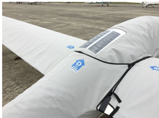
DG-505 Full Cover Set

WINTER USE MATERIAL - Made with Solution-Dyed Polyester fabric, this option is intended for seasonal use to aid in deicing, rain mitigation, or for occasional travel. The material is lighter and more compact, but more susceptible to UV damage and may have a shorter useful life if used continuously outside than the all-year use material.