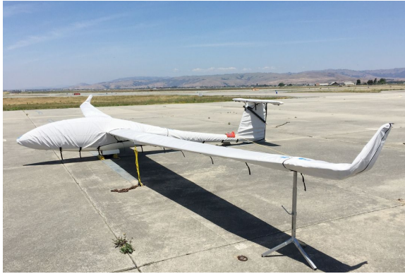
Schmepp-Hirth Discus 2B Full Cover Set

This cover type is made from Silver Acrylic Sunbrella canvas and is 100% lined with a soft and smooth microfiber. Bruce's Custom Covers developed this material combination especially for aircraft protection. The outer material is medium weight and treated for water resistance, UV resistance and anti-static buildup. The inner lining is a very soft and smooth microfiber to prevent scratching. The material is very reflective, and tests show that the cabin interior temperature can be reduced to near-ambient temperature on the hottest of days. It is water, ice and snow repellent, yet breathable to allow moisture to escape from between the cover and the aircraft surface.