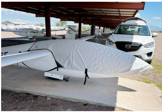
Schleicher ASW-19 Canopy/Nose Cover