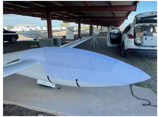
Schleicher ASW-19 Canopy/Nose Cover, test fit cover