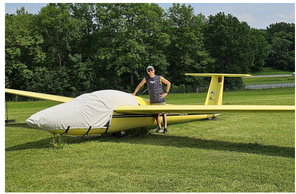
ASW-19, SGS, SGU, 1 & 2 Models Canopy/Nose Cover