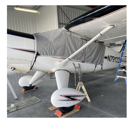
Consolidated Vultee V-77 Travel Cover