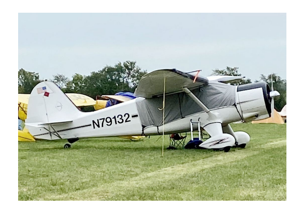
Consolidated Vultee V-77 Travel Cover