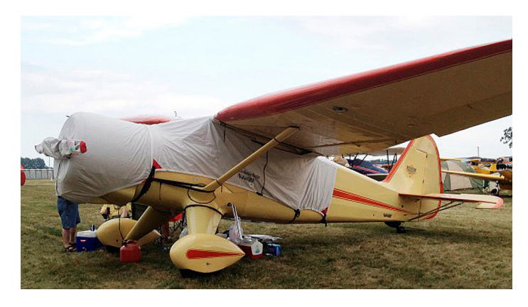
Stinson Reliant Over-the-top Canopy, Engine & Propellor Covers