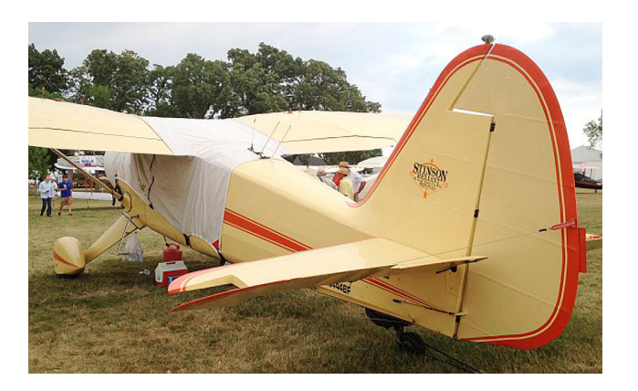
Stinson Reliant Over-the-top Canopy Cover