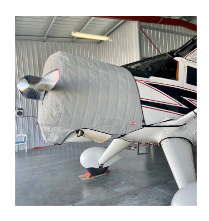
Stinson Reliant V-77, SR, AT-19 Insulated Engine Cover