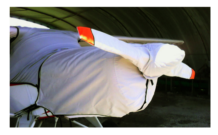
Auster J5 Canopy, Engine, and Propellor Covers