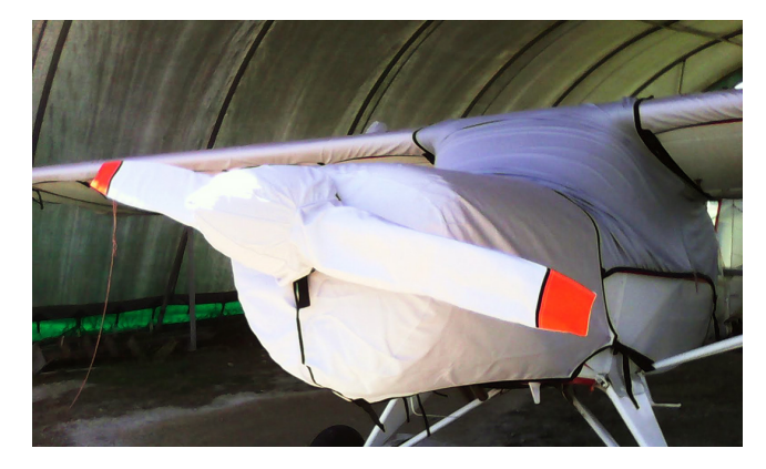
Auster J5 Canopy, Engine, and Propellor Covers