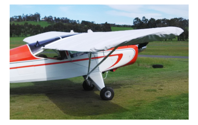
Auster J5 Autocar Wing Covers