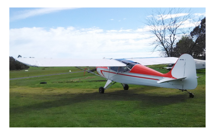
Auster J5 Autocar Wing Covers

WINTER USE MATERIAL - Made with Solution-Dyed Polyester fabric, this option is intended for seasonal use to aid in deicing, rain mitigation, or for occasional travel. The material is lighter and more compact, but more susceptible to UV damage and may have a shorter useful life if used continuously outside than the all-year use material.