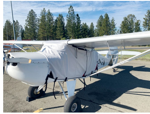
Avid Heavy Hauler MK 4 Over The Top Style Canopy Cover