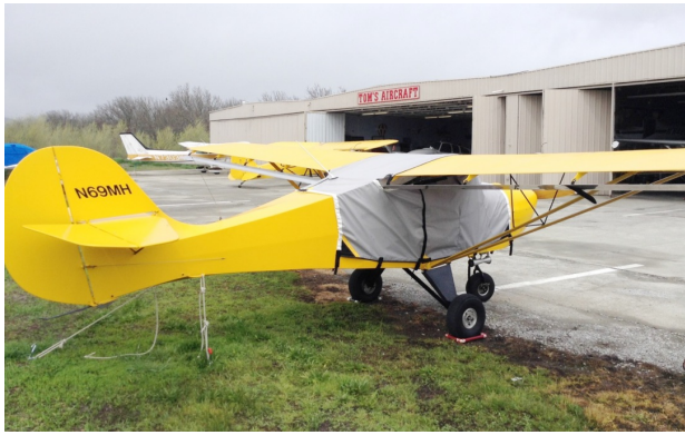
Avid Flyer Extended Canopy Cover