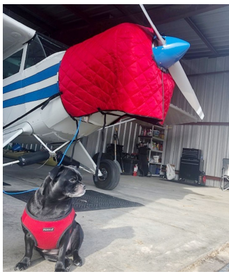
Piper PA-12 Insulated Hangar Blanket