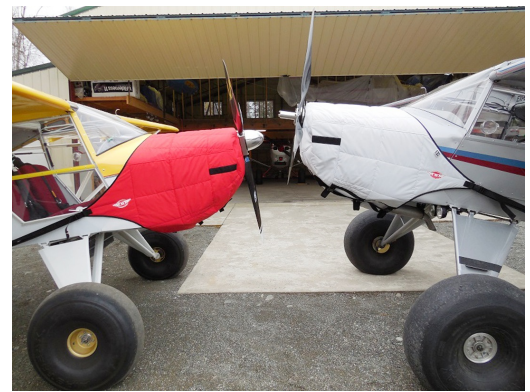
Avid Insulated Engine Covers