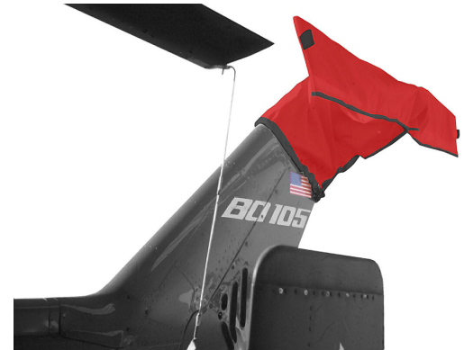
MBB BO-105 Tail Rotor/Gearbox Cover