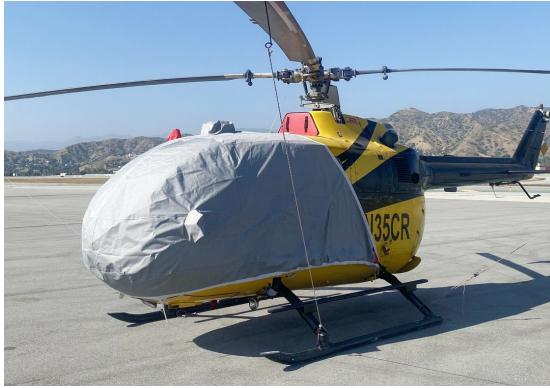
Eurocopter BO-105 Bubble Cover, Standard Model

The Engine Inlet Plugs are custom fit for your Eurocopter BO-105 intakes, made with heavy-duty vinyl material, and stuffed with a single block of sculpted urethane foam. Each plug has a zipper that allows the foam to be removed and dried if necessary. Engine plugs have 'Remove Before Flight' streamers sewn onto the face of the plugs. Most plugs are imprinted with the aircraft registration number in black for an extra charge. Storage bag NOT included. Engine plugs may be inserted after flight when the engine is still warm. Engine Inlet Plugs are commonly referred to as Cowl Plugs, Intake Plugs, Cowl Blocks, Engine Blocks, and Engine Bungs.