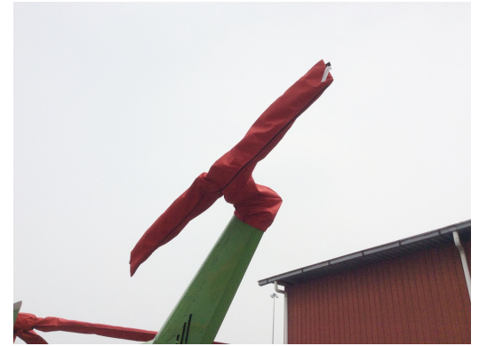
MBB BO-105 Tail Rotor Covers