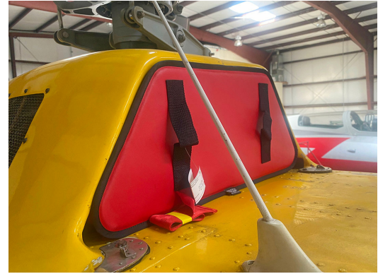
BO 105CB Intake Plug