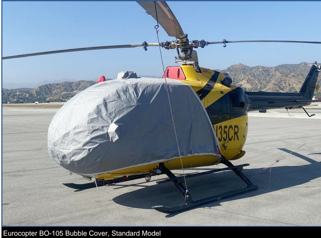
Eurocopter BO-105 Bubble Cover, Standard Model