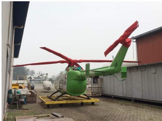
MBB BO-105 Blade, Rotor Head & Tail Rotor Covers

WINTER USE MATERIAL - Made with Solution-Dyed Polyester fabric, this option is intended for seasonal use to aid in deicing, rain mitigation, or for occasional travel. The material is lighter and more compact, but more susceptible to UV damage and may have a shorter useful life if used continuously outside than the all-year use material.