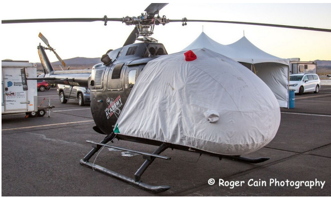
MBB BO-105 Bubble Cover