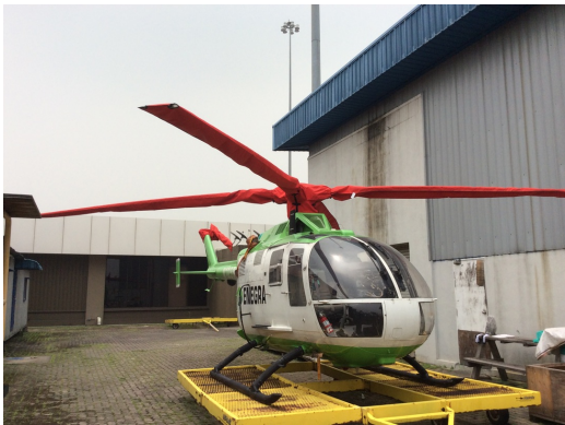
MBB BO-105 Blade, Rotor Head & Tail Rotor Covers