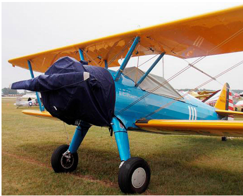
Stearman PT-13 Engine Cover