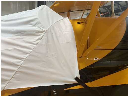
Bucher BU-133 Jungmeister Canopy Cover, test fit cover