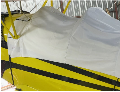
Bucker Jungmann BU-131 Canopy Cover, test fit cover

the hottest of days. It is water, ice and snow repellent, yet breathable to allow moisture to escape from between the cover and the aircraft surface.