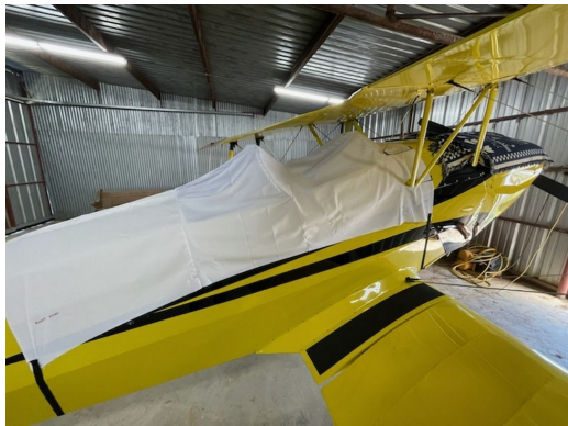
Bucker Jungmann BU-131 Canopy Cover, test fit cover

the hottest of days. It is water, ice and snow repellent, yet breathable to allow moisture to escape from between the cover and the aircraft surface.