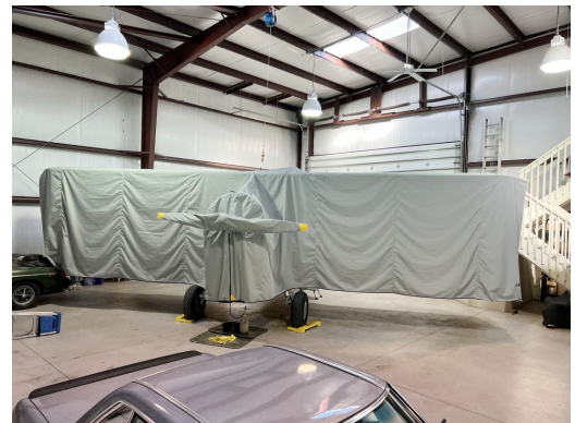
Stearman PT-13 Full Body Dust Cover