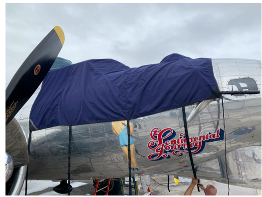
Boeing B-17 Canopy Cover