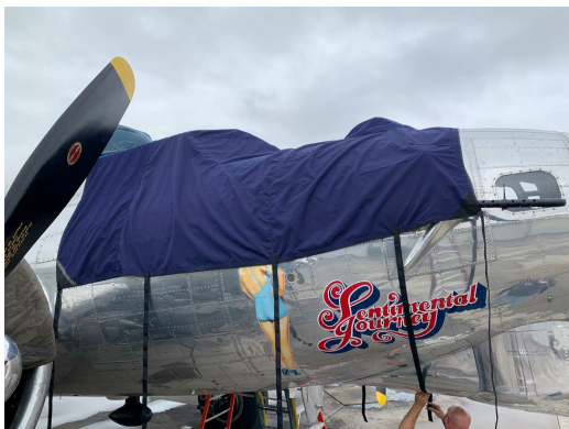
Boeing B-17 Canopy Cover