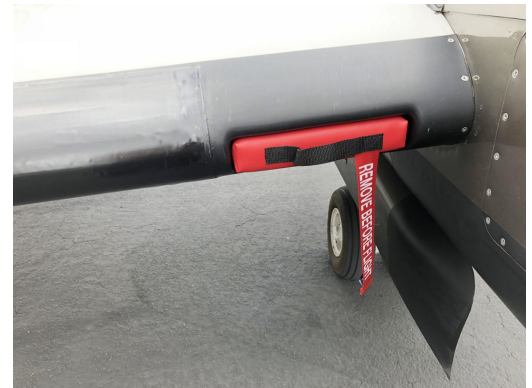
ENGINE PLUGS PREVENT BIRD NEST FOD. Piper Saratoga Engine Cowling Bird's Nest Beech King Air Heat Exchanger Inlet Plug