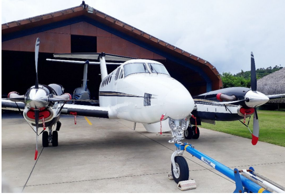
King Air B200 Heat Exchanger Inlet Plugs

This cover type is made from Silver Acrylic Sunbrella canvas and is 100% lined with a soft and smooth microfiber. Bruce's Custom Covers developed this material combination especially for aircraft protection. The outer material is medium weight and treated for water resistance, UV resistance and anti-static buildup. The inner lining is a very soft and smooth microfiber to prevent scratching. The material is very reflective, and tests show that the cabin interior temperature can be reduced to near-ambient temperature on the hottest of days. It is water, ice and snow repellent, yet breathable to allow moisture to escape from between the cover and the aircraft surface.