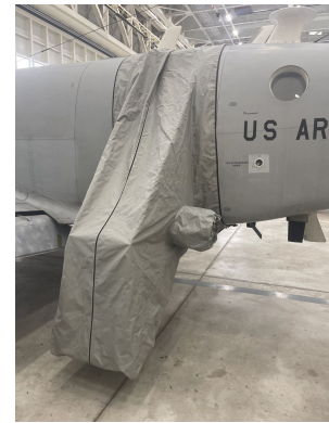
King Air Airstair Door Cover