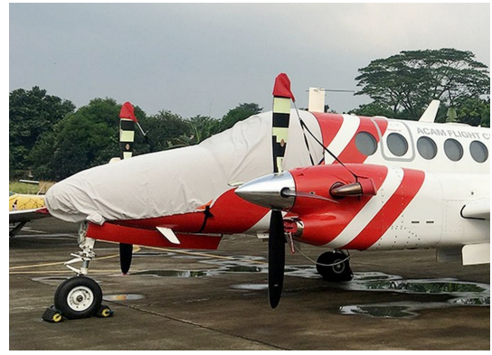
Beech King Air 200 Cockpit/Nose Cover