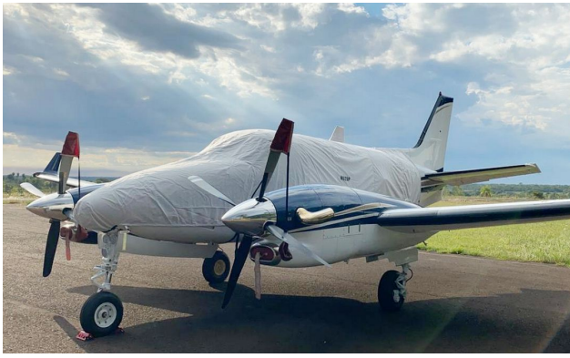
King Air C90GTi Canopy/Nose Cover