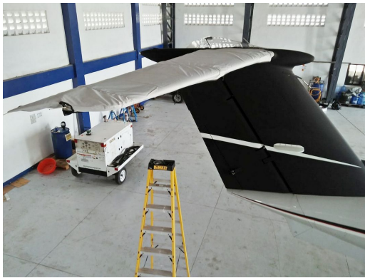
Beech King Air B350 Horizontal Stabilizer Covers

WINTER USE MATERIAL - Made with Solution-Dyed Polyester fabric, this option is intended for seasonal use to aid in deicing, rain mitigation, or for occasional travel. The material is lighter and more compact, but more susceptible to UV damage and may have a shorter useful life if used continuously outside than the all-year use material.