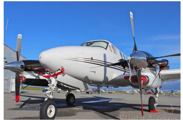
King Air C90A Engine Plugs and Pitot Covers