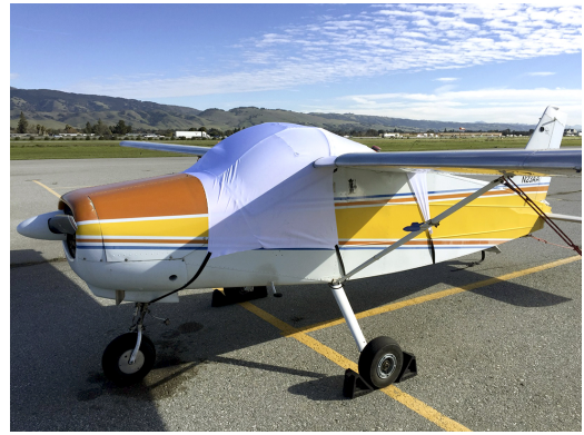
Bolkow Junior 208 Canopy Cover (test fit)