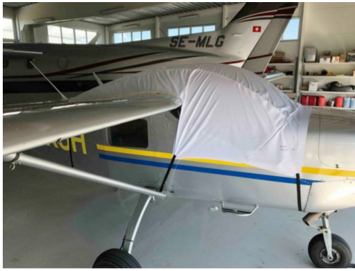
Saab Safari Canopy Cover, test fit cover