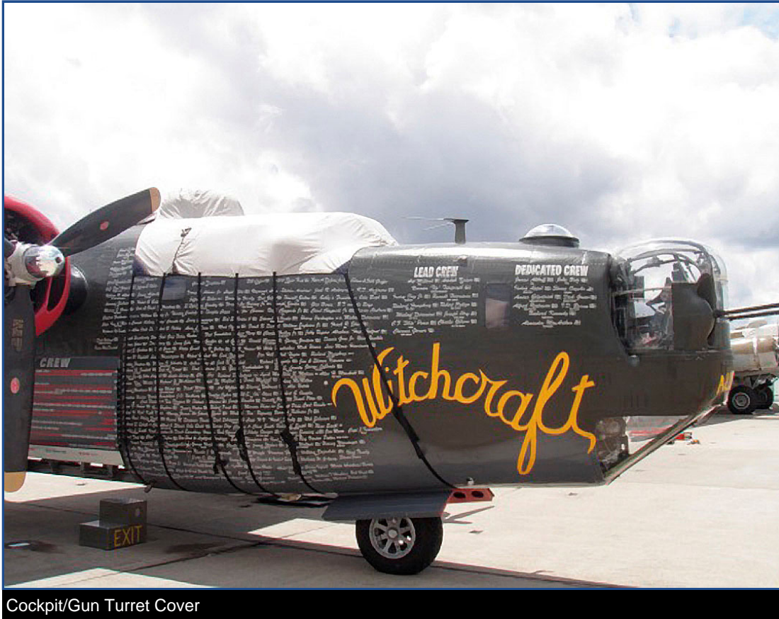
Cockpit/Gun Turret Cover