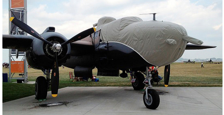
B25 Cockpit/Nose and Gun Turret Covers