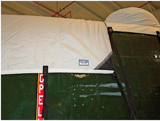
B25 Gun Turret Cover