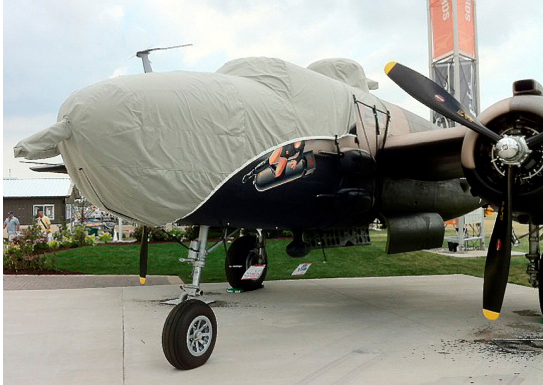
B25 Cockpit/Nose and Gun Turret Covers

This cover type is made from Silver Acrylic Sunbrella canvas and is 100% lined with a soft and smooth microfiber. Bruce's Custom Covers developed this material combination especially for aircraft protection. The outer material is medium weight and treated for water resistance, UV resistance and anti-static buildup. The inner lining is a very soft and smooth microfiber to prevent scratching. The material is very reflective, and tests show that the cabin interior temperature can be reduced to near-ambient temperature on the hottest of days. It is water, ice and snow repellent, yet breathable to allow moisture to escape from between the cover and the aircraft surface.