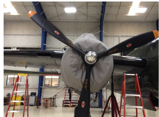
B25 Engine Cover