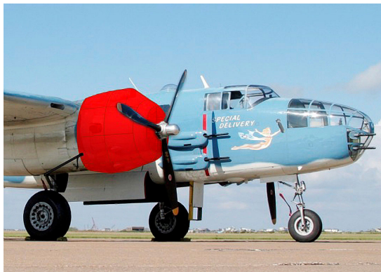
B25 Engine Cover, Illustration

Engine Covers will cinch around or behind the spinner, cover the entire engine cowl area including the engine air cooling and induction air inlets, and fastens together with Velcro beneath the spinner down the front of the cowling. The Engine Cover is attached with a belly strap aft of the firewall, and can Velcro to the Canopy Cover. Engine Covers are normally made from Solution-Dyed Polyester or Acrylic Sunbrella . An Insulated version of the engine cover can be made with a thicker, quilted, and water-repellent material. The Insulated Engine Cover works well in cold climates to help with engine preheating.