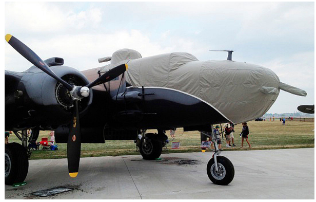
B26 Cockpit/Nose and Gun Turret Covers