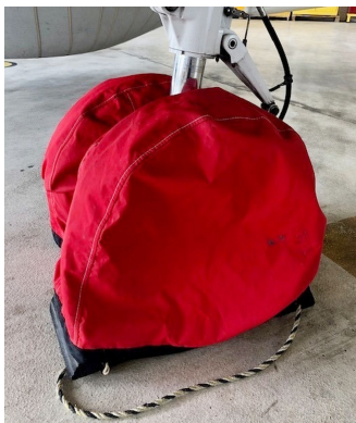
Beech King Air 300 Tire Covers (main gear)

ALL-YEAR USE MATERIAL - Made with Silver Acrylic Sunbrella canvas, the all-year use material is the best option for sun protection and cover longevity. This heavier more durable material is intended for all weather conditions, such as rain and snow or lots of sun.