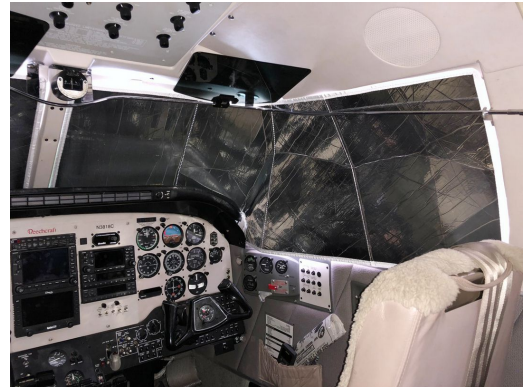
Beech King Air 90 & 100 (U-21, RU-21, T-44) Cockpit Heatshields