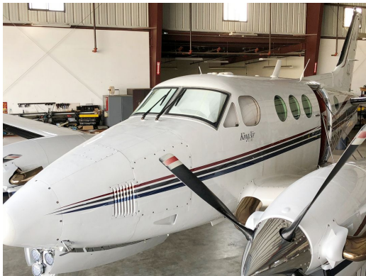
Beech King Air 90 & 100 (U-21, RU-21, T-44) Cockpit Heatshields

Cockpit Heatshields are interior sunshades for the aircraft's cockpit. The product is a unique composite of closed-cell foam with a silver mylar finish. The semi-rigid design is stiff enough to stand inside the window framing. The set folds up flat and is easily stored in the included storage sleeve. Some designs may require velcro and suction cups. A Heatshield is an excellent short-term remedy for cockpit overheating, but an external fabric cover is more effective for long-term protection.