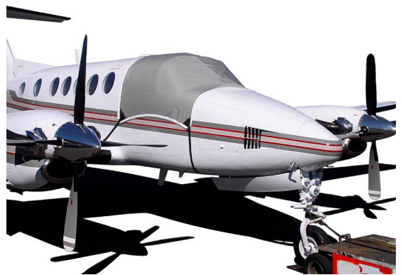
King Air 200/300 Snap-On Windshield Cover