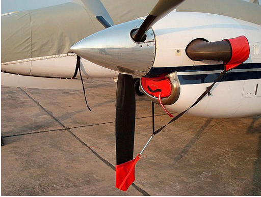
Prop Tie-down/Exhaust Covers

water resistance, UV resistance and anti-static buildup. The inner lining is a very soft and smooth microfiber to prevent scratching. The material is very reflective, and tests show that the cabin interior temperature can be reduced to near-ambient temperature on the hottest of days. It is water, ice and snow repellent, yet breathable to allow moisture to escape from between the cover and the aircraft surface.