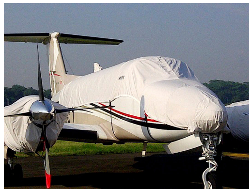
King Air 350 Canopy/Nose Cover, Engine Covers