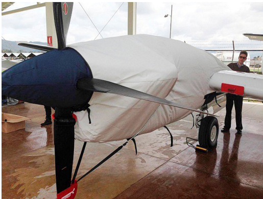
King Air C90 Engine Cover