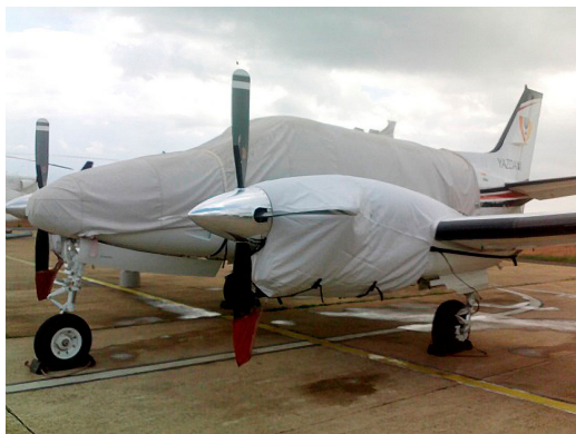
King Air C90 Canopy/Nose Cover, Engine Covers