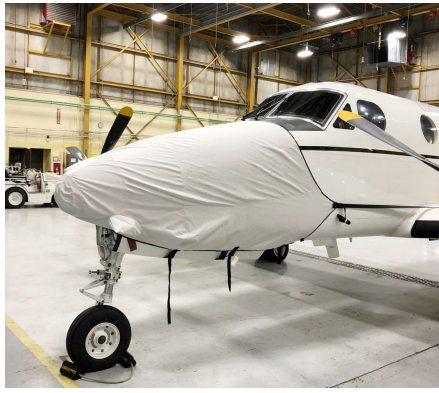
King Air 200 Nose Cover