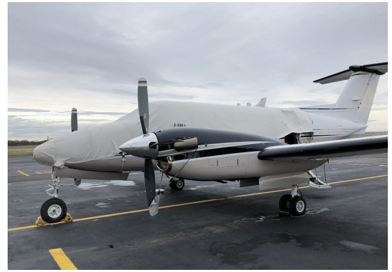
King Air 200 Canopy/Nose Cover