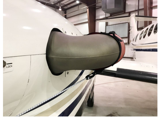
Beech King Air 350 Exhaust Covers