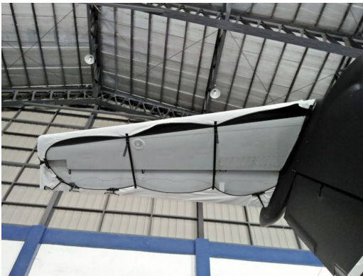
Beech King Air B350 Horizontal Stabilizer Covers

WINTER USE MATERIAL - Made with Solution-Dyed Polyester fabric, this option is intended for seasonal use to aid in deicing, rain mitigation, or for occasional travel. The material is lighter and more compact, but more susceptible to UV damage and may have a shorter useful life if used continuously outside than the all-year use material.