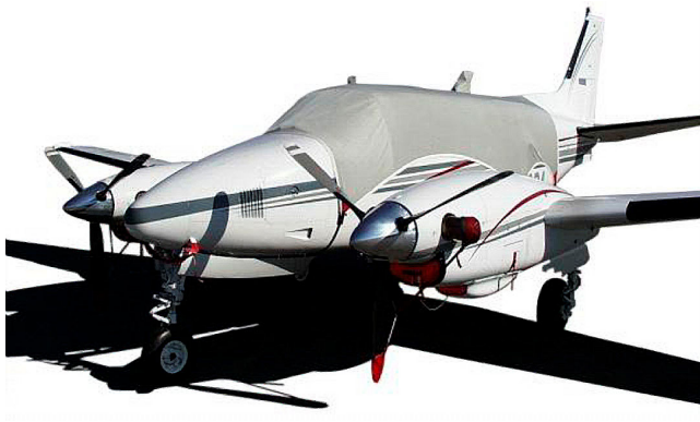
King Air Canopy Cover, Engine Plugs, Prop-Tie/Exhaust Covers