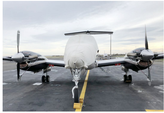
King Air 200 Canopy/Nose Cover