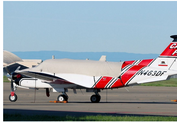
Beech King Air B200 Canopy/Nose Cover