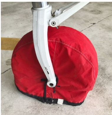
Beech King Air 300 Tire Covers (nose gear)