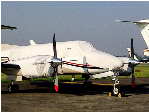
King Air 350 Canopy/Nose Cover, Engine Covers

water resistance, UV resistance and anti-static buildup. The inner lining is a very soft and smooth microfiber to prevent scratching. The material is very reflective, and tests show that the cabin interior temperature can be reduced to near-ambient temperature on the hottest of days. It is water, ice and snow repellent, yet breathable to allow moisture to escape from between the cover and the aircraft surface.