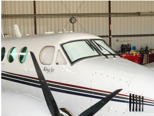
Beech King Air 90 & 100 (U-21, RU-21, T-44) Cockpit Heatshields

Cockpit Heatshields are interior sunshades for the aircraft's cockpit. The product is a unique composite of closed-cell foam with a silver mylar finish. The semi-rigid design is stiff enough to stand inside the window framing. The set folds up flat and is easily stored in the included storage sleeve. Some designs may require velcro and suction cups. A Heatshield is an excellent short-term remedy for cockpit overheating, but an external fabric cover is more effective for long-term protection.