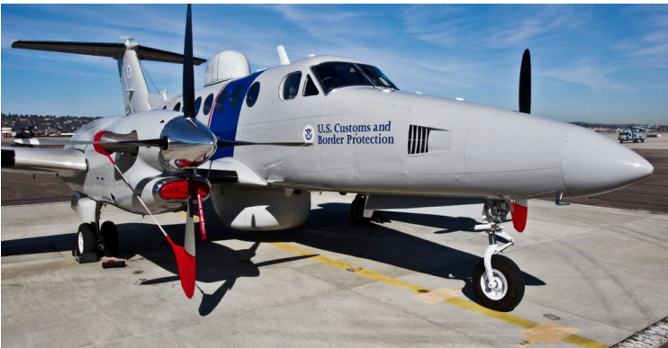
King Air 300 Canopy Cover, Engine Plugs, Prop Tie/Exhaust Covers