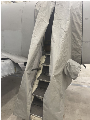
King Air Airstair Coor Cover

WINTER USE MATERIAL - Made with Solution-Dyed Polyester fabric, this option is intended for seasonal use to aid in deicing, rain mitigation, or for occasional travel. The material is lighter and more compact, but more susceptible to UV damage and may have a shorter useful life if used continuously outside than the all-year use material.