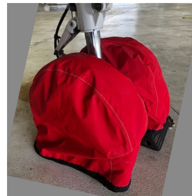
Beech King Air 300 Tire Covers (main gear)