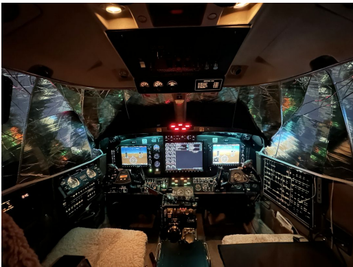
Beechcraft B200 Cockpit Heatshields