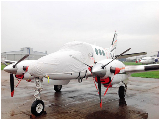
King Air Cockpit/Nose Cover, Plugs, Prop Tie/Exhaust Covers