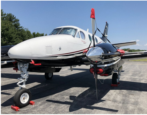
Beech C90A Prop Tie Downs/Exhaust Covers

be inserted after flight when the engine is still warm. Engine Inlet Plugs are commonly referred to as Cowl Plugs, Intake Plugs, Cowl Blocks, Engine Blocks, and Engine Bung s.