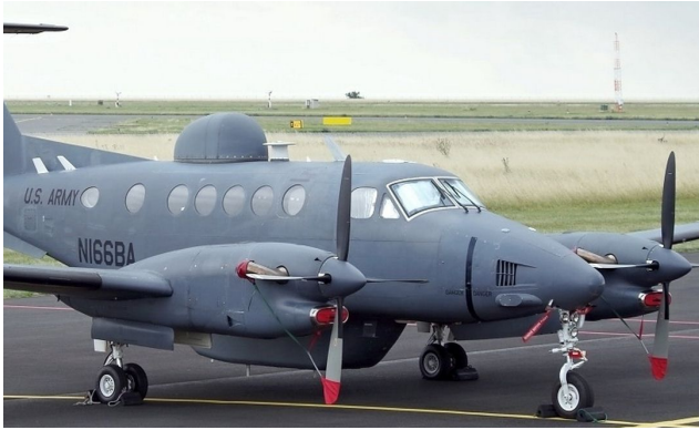
Beech King Air 300 Cockpit HeatShields, Engine Plugs, Prop Ties

for cockpit overheating, but an external fabric cover is more effective for long-term protection.