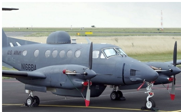
Beech King Air 300 Cockpit HeatShields, Engine Plugs, Prop Ties