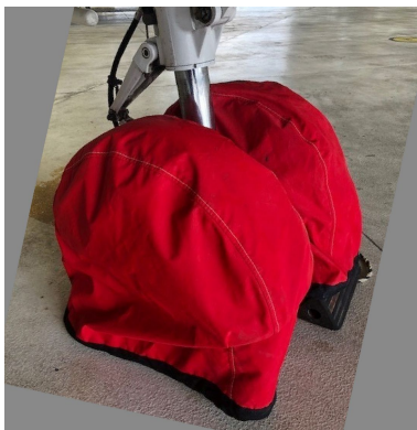
Beech King Air 300 Tire Covers (main gear)

ALL-YEAR USE MATERIAL - Made with Silver Acrylic Sunbrella canvas, the all-year use material is the best option for sun protection and cover longevity. This heavier more durable material is intended for all weather conditions, such as rain and snow or lots of sun.