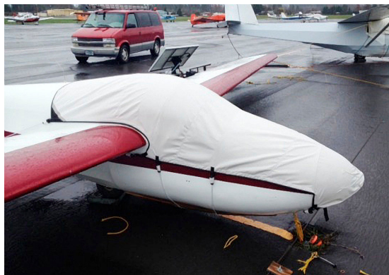
SGS 1-26B Canopy/Nose Cover