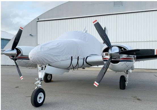
Beech Twin Bonanza Canopy/Nose Cover