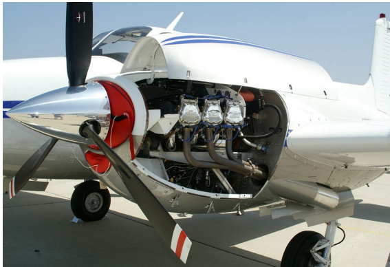
Twin Bonanza Engine Inlet Plugs