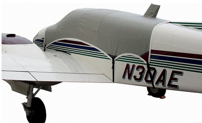
Twin Bonanza Standard Canopy Cover

Travel Covers are made with Silver Solution-Dyed Polyester fabric and only lined over the windshield to save weight. The material is lightweight and more compact for easy stowage in the aircraft. The polyester material is water resistant, but only intended for occasional use outside. We also have an ultra lightweight material available for fitted hangar dust covers. For daily outdoor use, the non-travel Sunbrella Cover is the best choice.