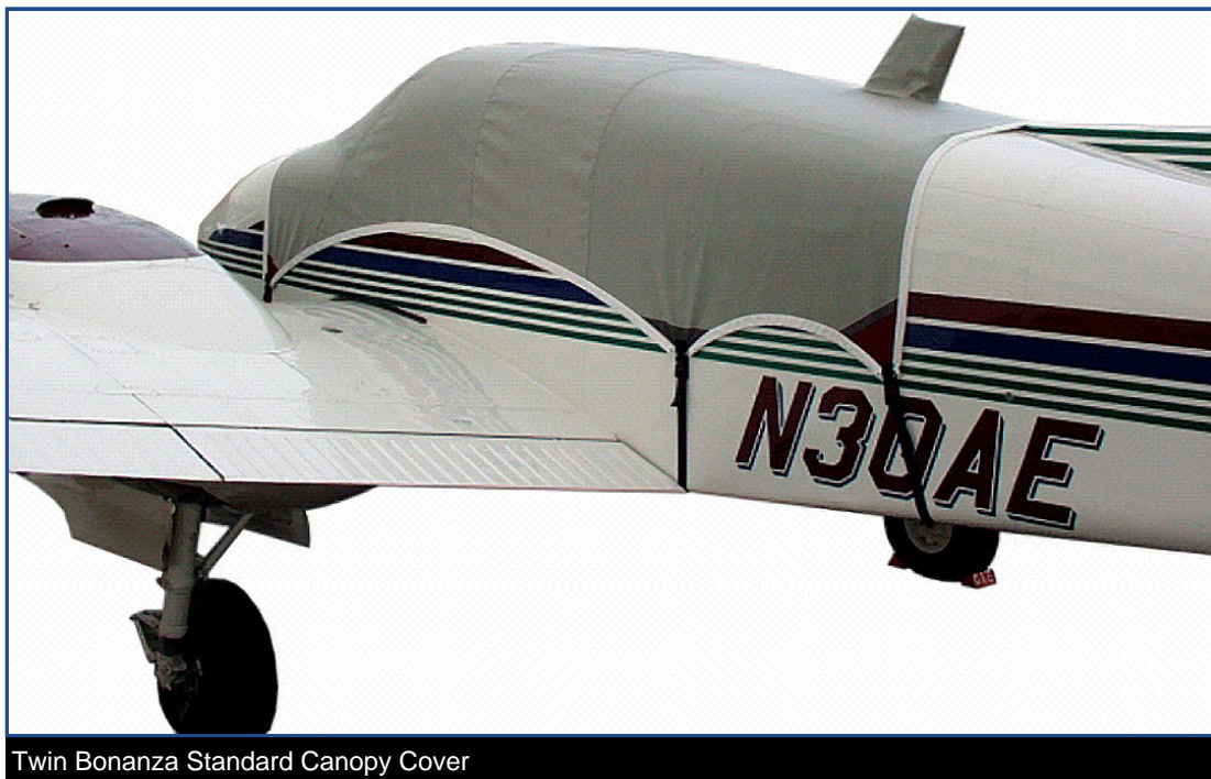
Twin Bonanza Standard Canopy Cover