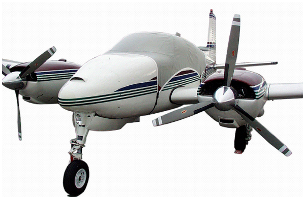
Twin Bonanza Standard Canopy Cover

This cover type is made from Silver Acrylic Sunbrella canvas and is 100% lined with a soft and smooth microfiber. Bruce's Custom Covers developed this material combination especially for aircraft protection. The outer material is medium weight and treated for water resistance, UV resistance and anti-static buildup. The inner lining is a very soft and smooth microfiber to prevent scratching. The material is very reflective, and tests show that the cabin interior temperature can be reduced to near-ambient temperature on the hottest of days. It is water, ice and snow repellent, yet breathable to allow moisture to escape from between the cover and the aircraft surface.