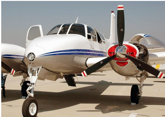
Twin Bonanza Plugs