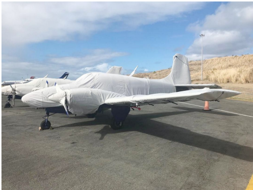
Beech Travel Air Full Cover Set