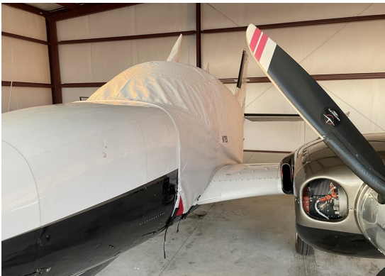
Beech Baron 58TC Extended Canopy Cover