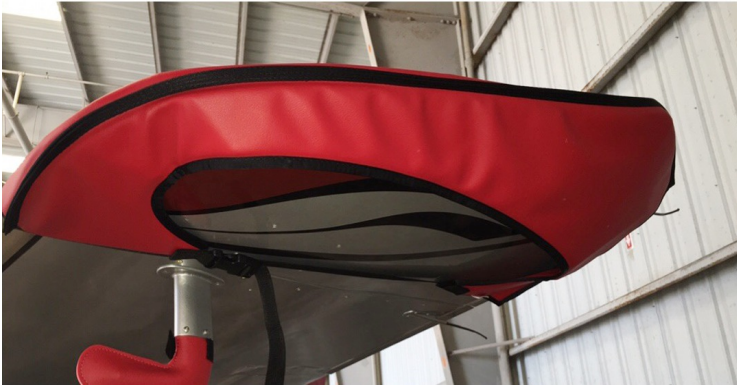
Cirrus SR-20/22 Wingtip Pads

Designed to prevent damage to the aircraft extremities in crowded hangars, these products are made of bright red Naugahyde and thickly padded with a sandwich of closed cell foam.