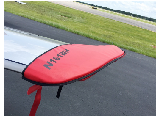
Cirrus SR-20/22 Wingtip Pads