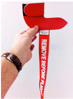
Standard Pitot Cover