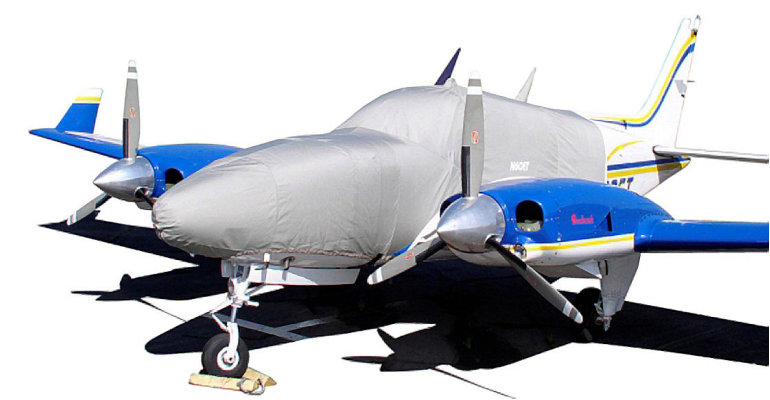
Baron Canopy/Nose Cover

Travel Covers are made with Silver Solution-Dyed Polyester fabric and only lined over the windshield to save weight. The material is lightweight and more compact for easy stowage in the aircraft. The polyester material is water resistant, but only intended for occasional use outside. We also have an ultra lightweight material available for fitted hangar dust covers. For daily outdoor use, the non-travel Sunbrella Cover is the best choice.