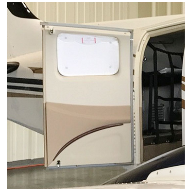
Beech Baron 58 Cabin HeatShield