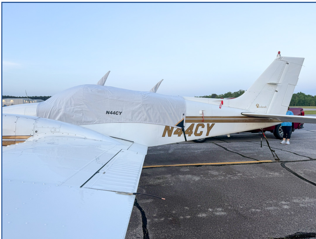
Beech Baron B55 Canopy Cover