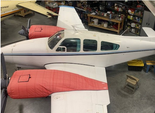
Standard Canopy Cover & Engine Plugs. Extended Canopy Cover & Engine Cover Beech Baron B55 Insulated Engine Covers