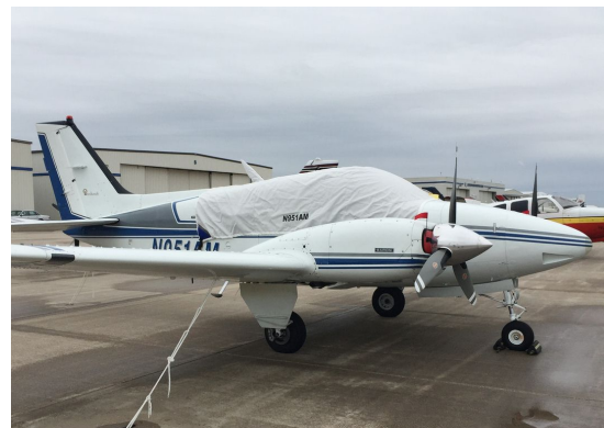
Baron FULL COVER SET, Light Weight Travel &/or Fitted Dust Cover Set Beech 95-B55 Baron Canopy Cover, Engine Plugs