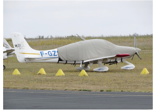
Cirrus SR-22 Extended Canopy/Engine Cover, Prop Cover, Wingtip Pads