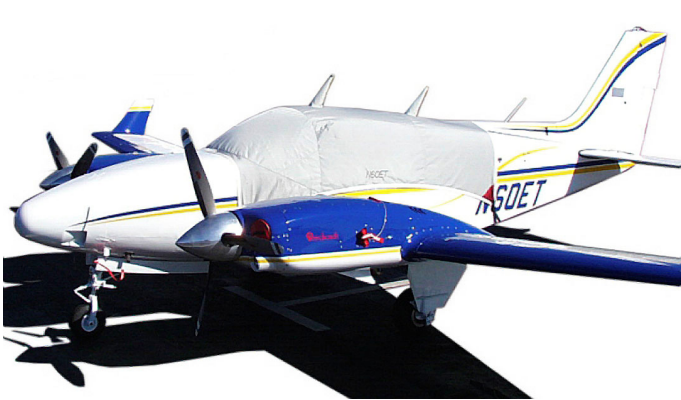
Standard Canopy Cover & Engine Plugs