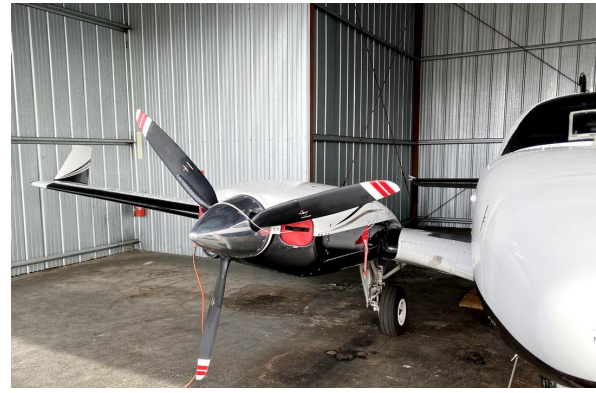
Baron 58 Engine Plugs