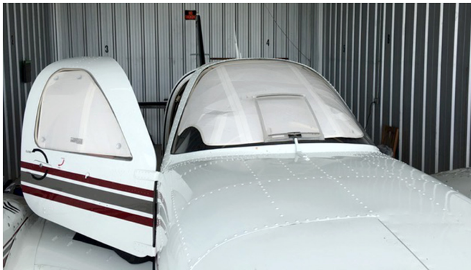
Beech Baron 58P Cockpit Heatshield Set

Windshield Heatshields are interior sunshades for an aircraft's front windshield. The product is a unique composite of closed-cell foam with a silver mylar finish. The semi-rigid design is stiff enough to stand along the inside of the windshield using sun visors or window framing. It folds up flat and easily stores in the included storage sleeve. Some designs may require velcro and suction cups or split right and left sides. A Heatshield is an excellent short-term remedy for cockpit overheating. An external fabric cover is far more effective and practical for long-term protection.