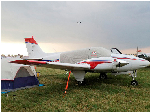
Beech Baron Standard Extended Canopy Cover

water resistance, UV resistance and anti-static buildup. The inner lining is a very soft and smooth microfiber to prevent scratching. The material is very reflective, and tests show that the cabin interior temperature can be reduced to near-ambient temperature on the hottest of days. It is water, ice and snow repellent, yet breathable to allow moisture to escape from between the cover and the aircraft surface.