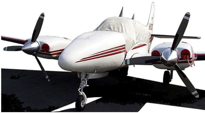
Baron 58 Standard Canopy Cover & Engine Plugs