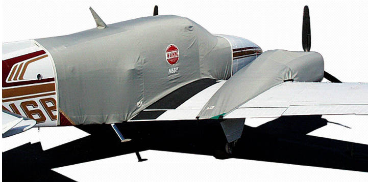
Baron Extended Canopy Cover & Engine Covers

This cover type is made from Silver Acrylic Sunbrella canvas and is 100% lined with a soft and smooth microfiber. Bruce's Custom Covers developed this material combination especially for aircraft protection. The outer material is medium weight and treated for water resistance, UV resistance and anti-static buildup. The inner lining is a very soft and smooth microfiber to prevent scratching. The material is very reflective, and tests show that the cabin interior temperature can be reduced to near-ambient temperature on the hottest of days. It is water, ice and snow repellent, yet breathable to allow moisture to escape from between the cover and the aircraft surface.