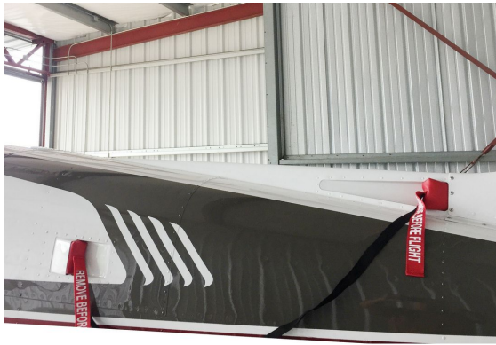
Beech Bonanza/Baron Fresh Air Intake & Exhaust Plugs