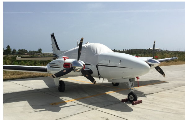
Baron 58 Canopy Cover, Engine Plugs