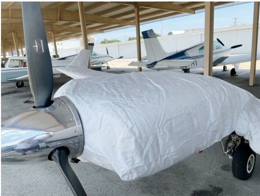
Beech Baron 58P Wing/Engine Covers (test fit)

WINTER USE MATERIAL - Made with Solution-Dyed Polyester fabric, this option is intended for seasonal use to aid in deicing, rain mitigation, or for occasional travel. The material is lighter and more compact, but more susceptible to UV damage and may have a shorter useful life if used continuously outside than the all-year use material.