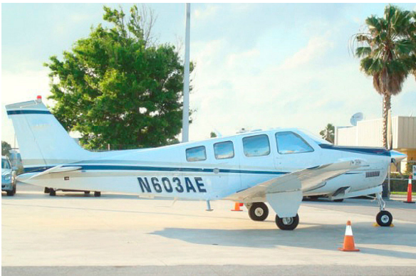
Beech Bonanza Heatshield Set