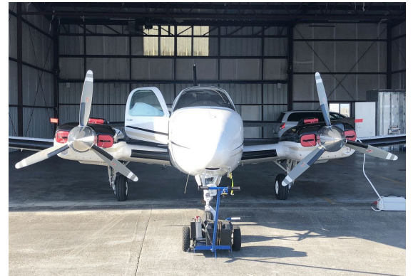
Beech Baron 58 Engine Inlet Plugs