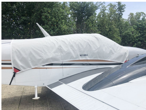
Baron G58 Travel Cover

Travel Covers are made with Silver Solution-Dyed Polyester fabric and only lined over the windshield to save weight. The material is lightweight and more compact for easy stowage in the aircraft. The polyester material is water resistant, but only intended for occasional use outside. We also have an ultra lightweight material available for fitted hangar dust covers. For daily outdoor use, the non-travel Sunbrella Cover is the best choice.