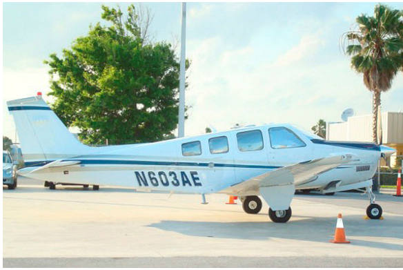
Beech Bonanza Heatshield Set