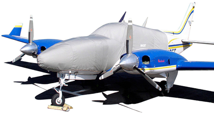
Baron Canopy/Nose Cover