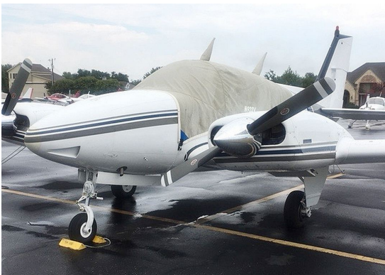
Beech Baron Canopy Cover

This cover type is made from Silver Acrylic Sunbrella canvas and is 100% lined with a soft and smooth microfiber. Bruce's Custom Covers developed this material combination especially for aircraft protection. The outer material is medium weight and treated for water resistance, UV resistance and anti-static buildup. The inner lining is a very soft and smooth microfiber to prevent scratching. The material is very reflective, and tests show that the cabin interior temperature can be reduced to near-ambient temperature on the hottest of days. It is water, ice and snow repellent, yet breathable to allow moisture to escape from between the cover and the aircraft surface.