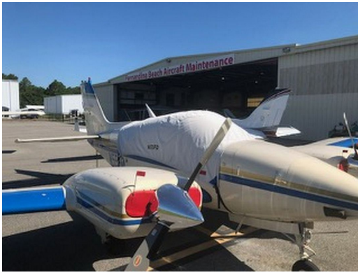
Beech Baron 95-B55 Canopy cover