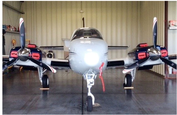
Beech Baron 58 Engine Inlet Plugs, Cowl Top Plugs, Heater Inlet, Pitot Cover