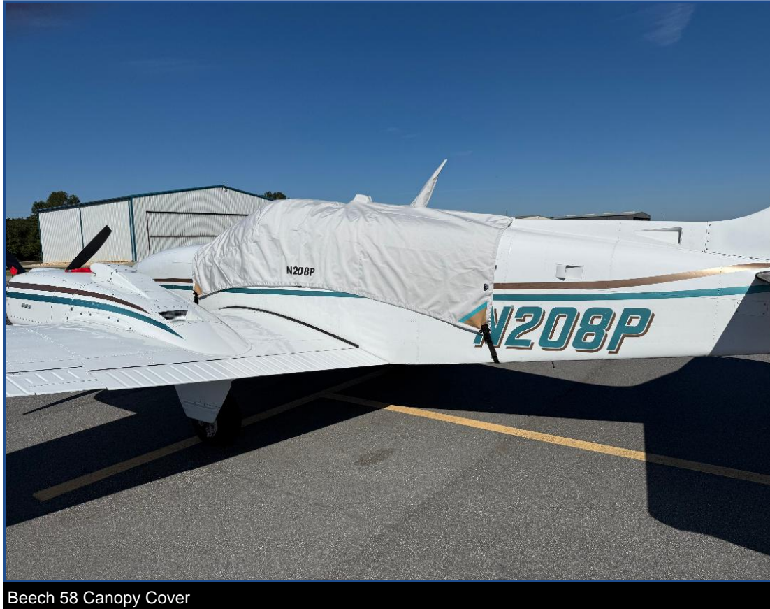
Beech 58 Canopy Cover