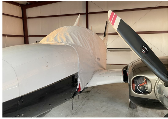
Beech Baron 58TC Extended Canopy Cover