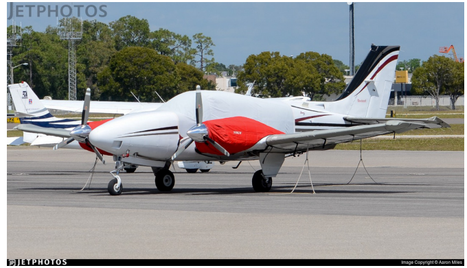
Beech Baron 58, G58 Canopy Cover, Insulated Engine Covers