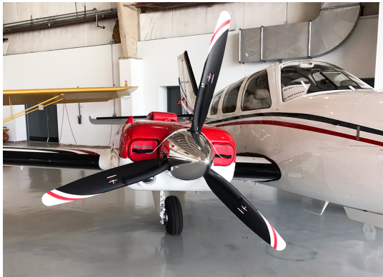
Beech Baron 58 Engine Inlet and Cowl Top Plugs, With A/C (G58 Models)

Engine Inlet Plugs are custom fit for your Beech Baron 58, G58 intakes, made with heavy-duty vinyl material, and stuffed with a single block of sculpted urethane foam. Each plug has a zipper that allows the foam to be removed and dried if necessary. Engine plugs have warning flags that are visible from the cockpit or 'remove before flight' streamers sewn onto the face of the plugs. Most plugs are imprinted with the aircraft registration number in black for an extra charge. Storage bag NOT included. Engine plugs may be inserted after flight when the engine is still warm. Engine Inlet Plugs are commonly referred to as Cowl Plugs, Intake Plugs, Cowl Blocks, Engine Blocks, and Engine Bungs.