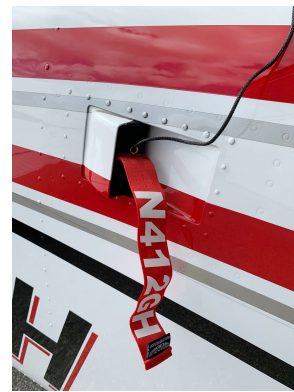
Beech Baron G58 Cabin Air Outlet Plug