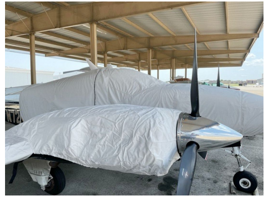
Beech Baron 58P Extended Canopy/Nose Cover, Wing/Engine Covers (test fit)