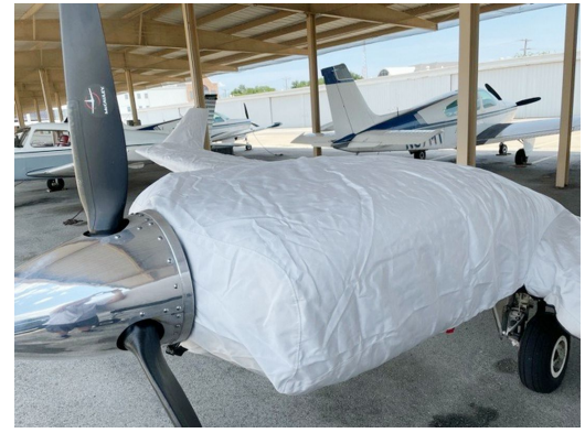
Beech Baron 58P Extended Canopy/Nose Cover, Wing/Engine Covers (test fit) Beech Baron 58P Wing/Engine Covers (test fit)