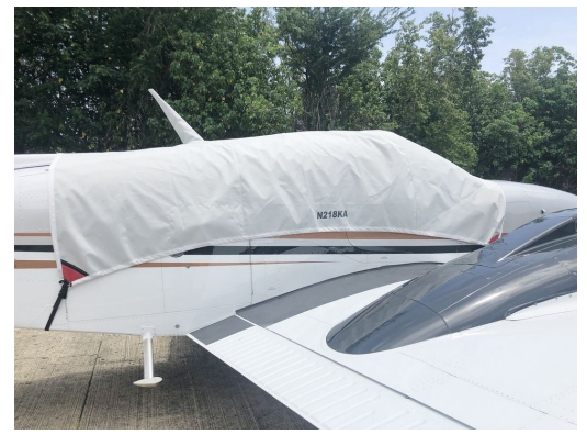
Baron G58 Travel Cover