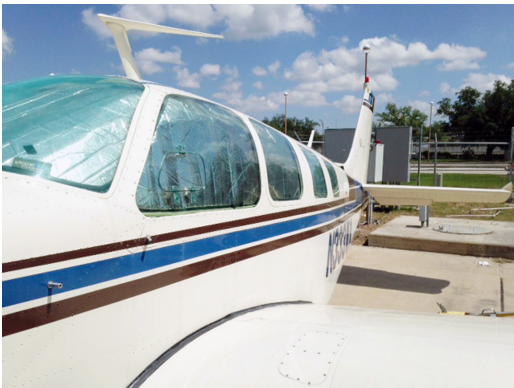
Beech Bonanza Heatshield Set

Windshield Heatshields are interior sunshades for an aircraft's front windshield. The product is a unique composite of closed-cell foam with a silver mylar finish. The semi-rigid design is stiff enough to stand along the inside of the windshield using sun visors or window framing. It folds up flat and easily stores in the included storage sleeve. Some designs may require velcro and suction cups or split right and left sides. A Heatshield is an excellent short-term remedy for cockpit overheating. An external fabric cover is far more effective and practical for long-term protection.