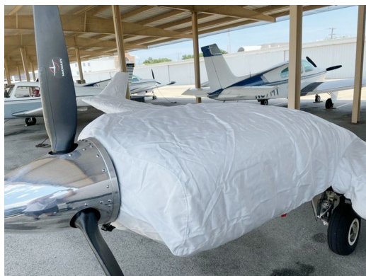
Beech Baron 58P Wing/Engine Covers (test fit)

WINTER USE MATERIAL - Made with Solution-Dyed Polyester fabric, this option is intended for seasonal use to aid in deicing, rain mitigation, or for occasional travel. The material is lighter and more compact, but more susceptible to UV damage and may have a shorter useful life if used continuously outside than the all-year use material.