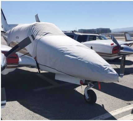
Beech Duke B-60 Nose Cover