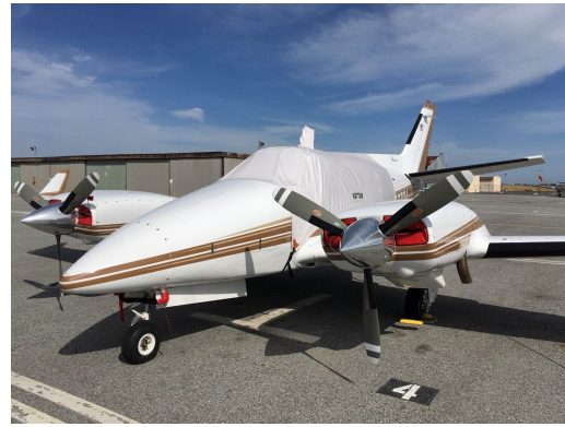
Beech Duke Canopy Cover, Engine Plugs, Pitot Covers