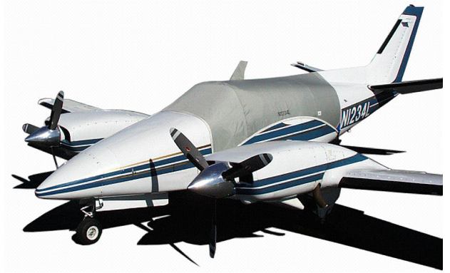
Beech Duke Standard Canopy Cover