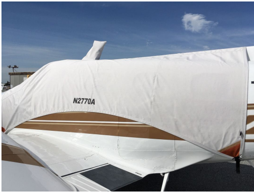
Beech Duke Canopy Cover