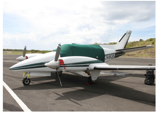
Beech Duke Canopy Cover, Engine Plugs