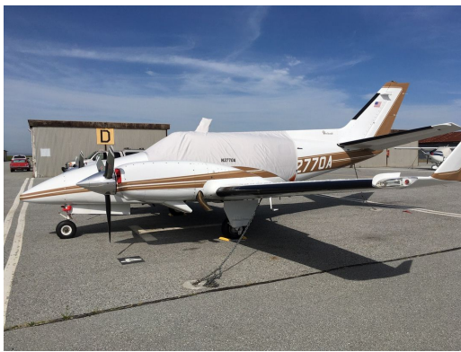
Beech Duke Canopy Cover, Engine Plugs, Pitot Covers