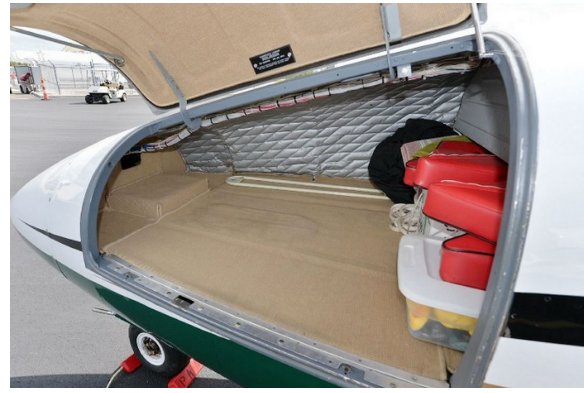
Beech Duke Engine Inlet Plugs stowed in the nose.