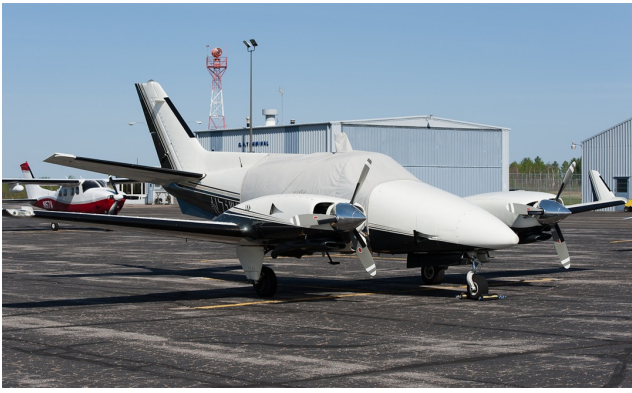
Beech Duke Canopy Cover