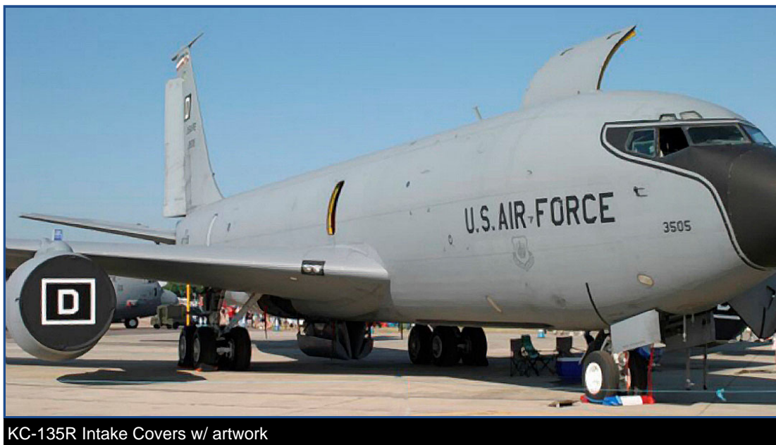
KC-135R Intake Covers w/ artwork