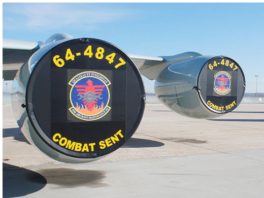
KC-135 Intake Covers for the 55th ARW, Offutt AFB

Blocks, Engine Blocks, and Engine Bungs.