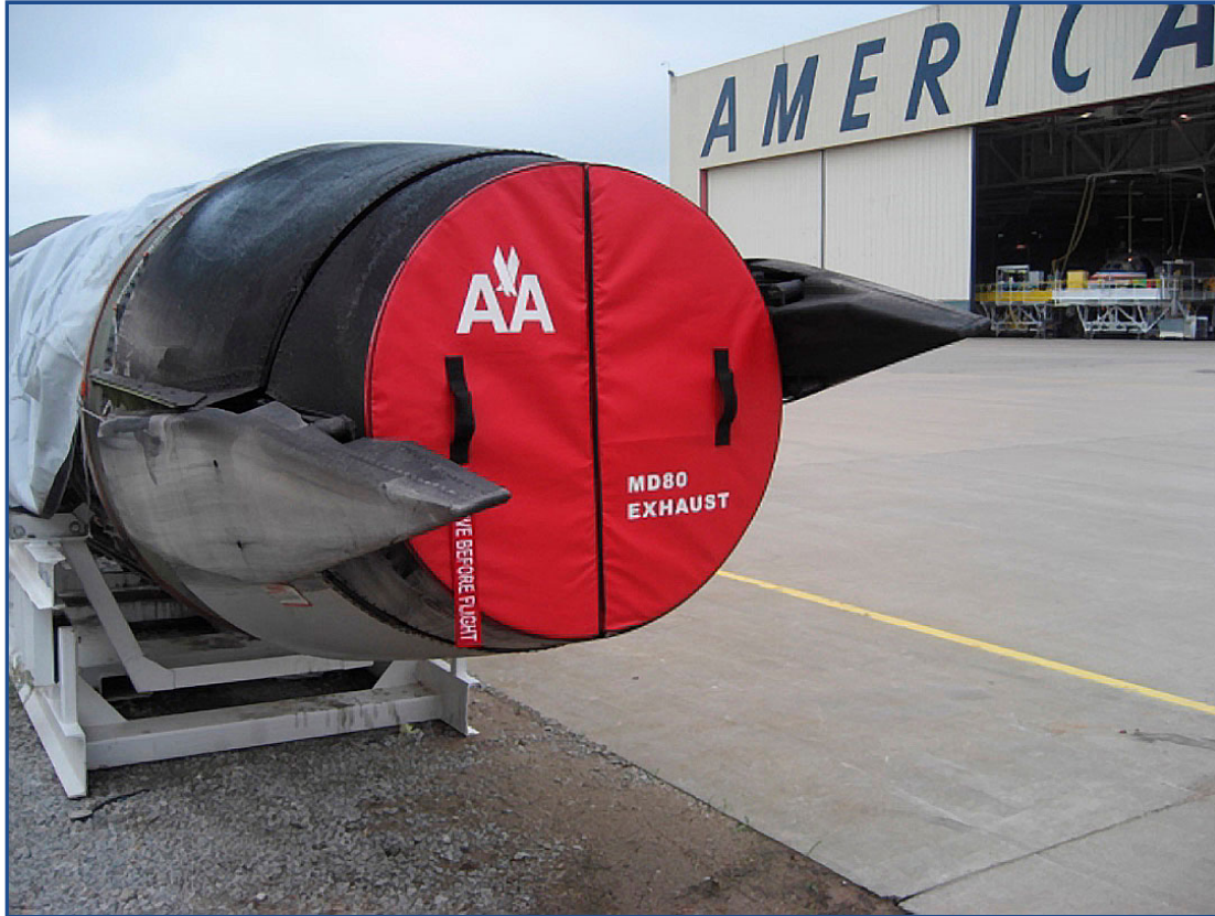
MD80 JT8D Exhaust Plug, Folding Type