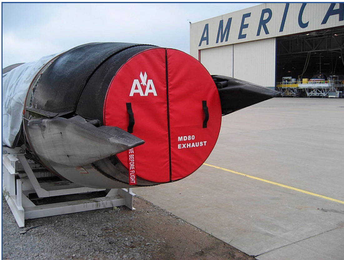
MD80 JT8D Exhaust Plug, Folding Type