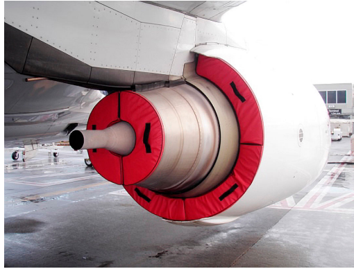
Boeing 737 NG Exhaust Plug Set, Folding Donut Ring Type

warm. Engine Inlet Plugs are commonly referred to as Cowl Plugs, Intake Plugs, Cowl Blocks, Engine Blocks, and Engine Bungs.